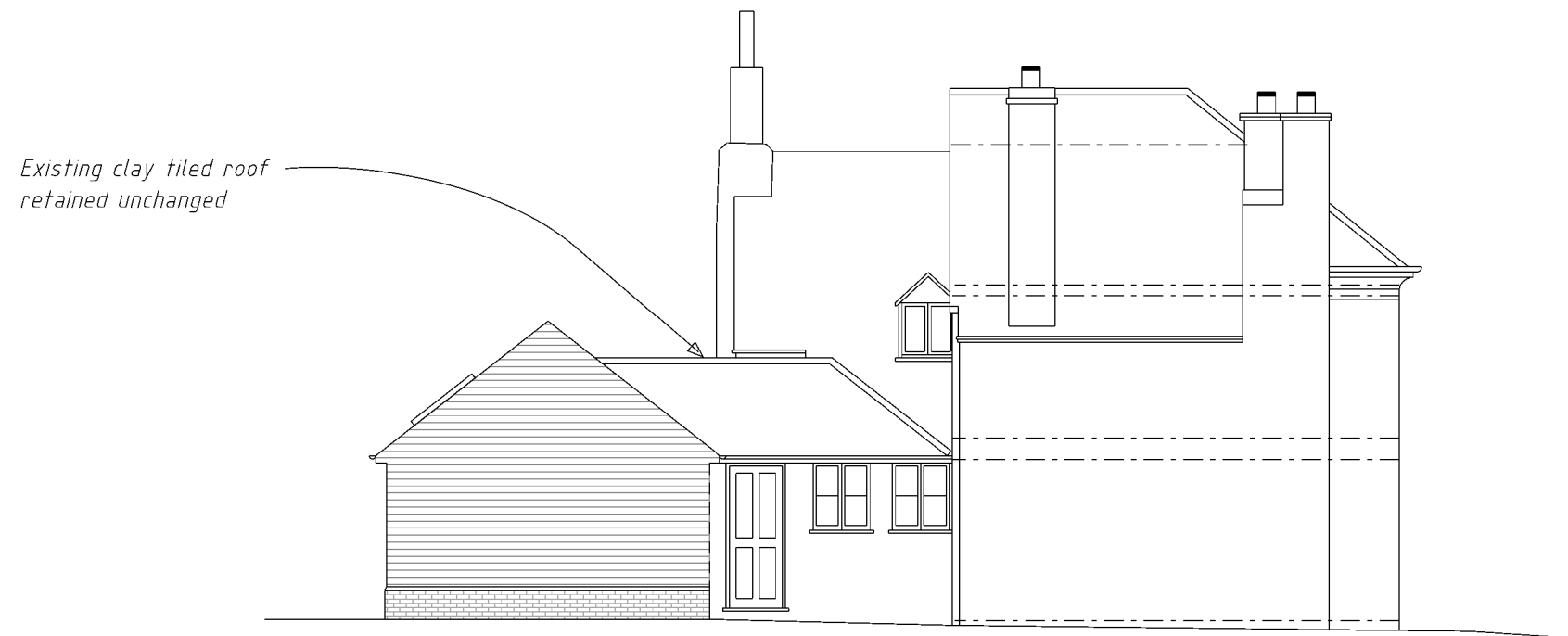
PROPOSED SIDE(S) ELEVATION (unchanged)