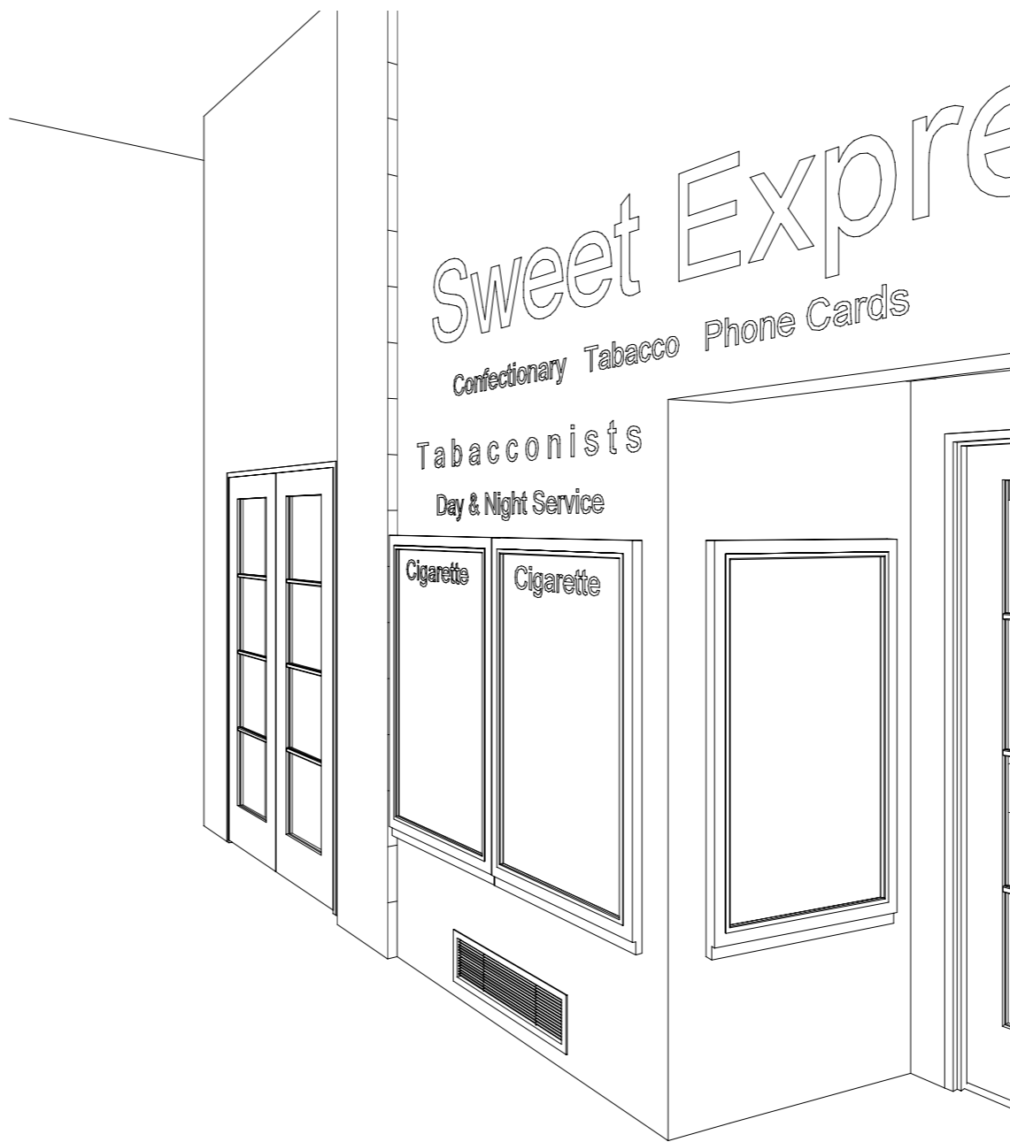
1 3D View 1