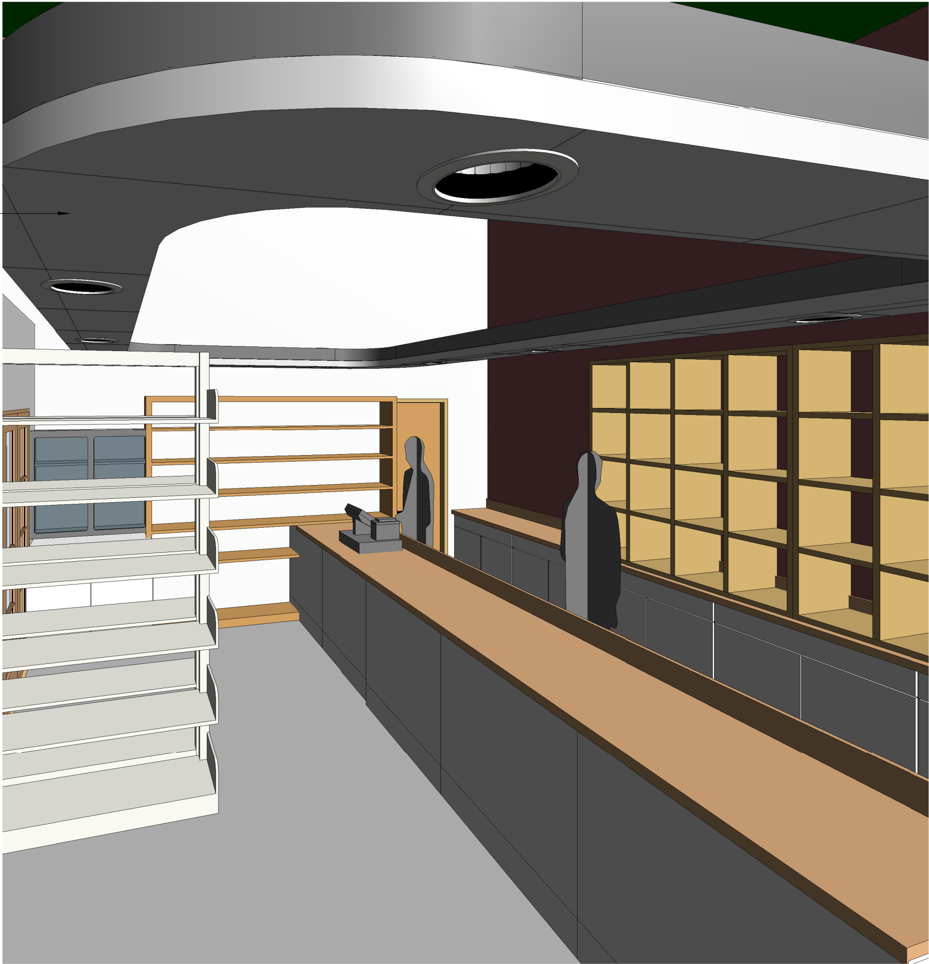
1 Proposed 3D View 4