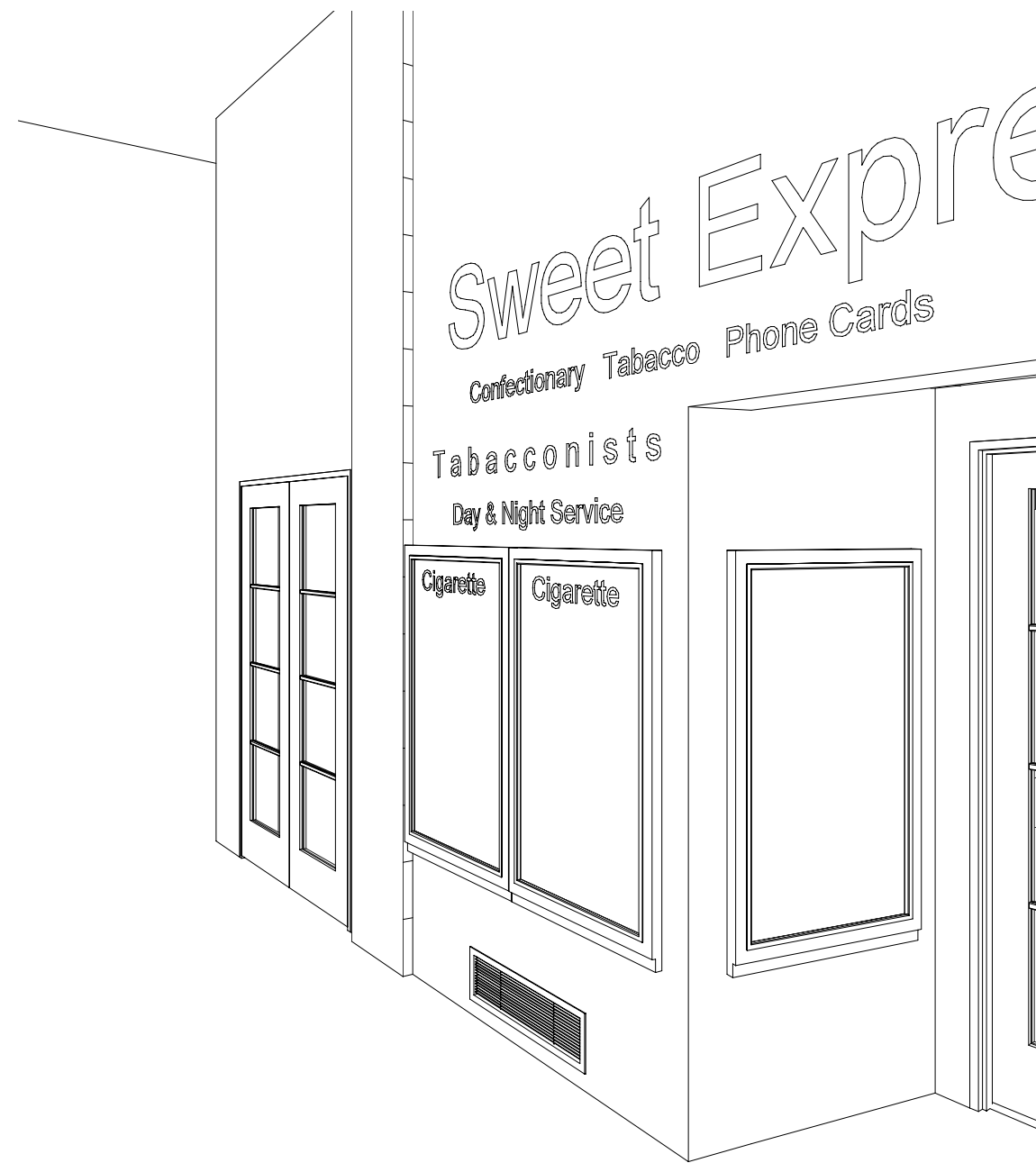
1 3D View 1