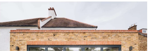
PHOTO SHOWING BRICK-ON-EDGE ON TILE CREASING Front/rear extension and garage with concealed gutter

This application seeks to follow the same design approach achieved at the neighbouring property 136 Northwood Way - REF 1402/APP/2015/3061 Side to rear wrap around extension taken from raised patio level