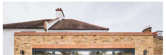
PHOTO SHOWING BRICK-ON-EDGE ON TILE CREASING Front/rear extension and garage with concealed gutter

This application seeks to follow the same design approach achieved at the neighbouring property 136 Northwood Way - REF 1402/APP/2015/3061 Side to rear wrap around extension taken from raised patio level