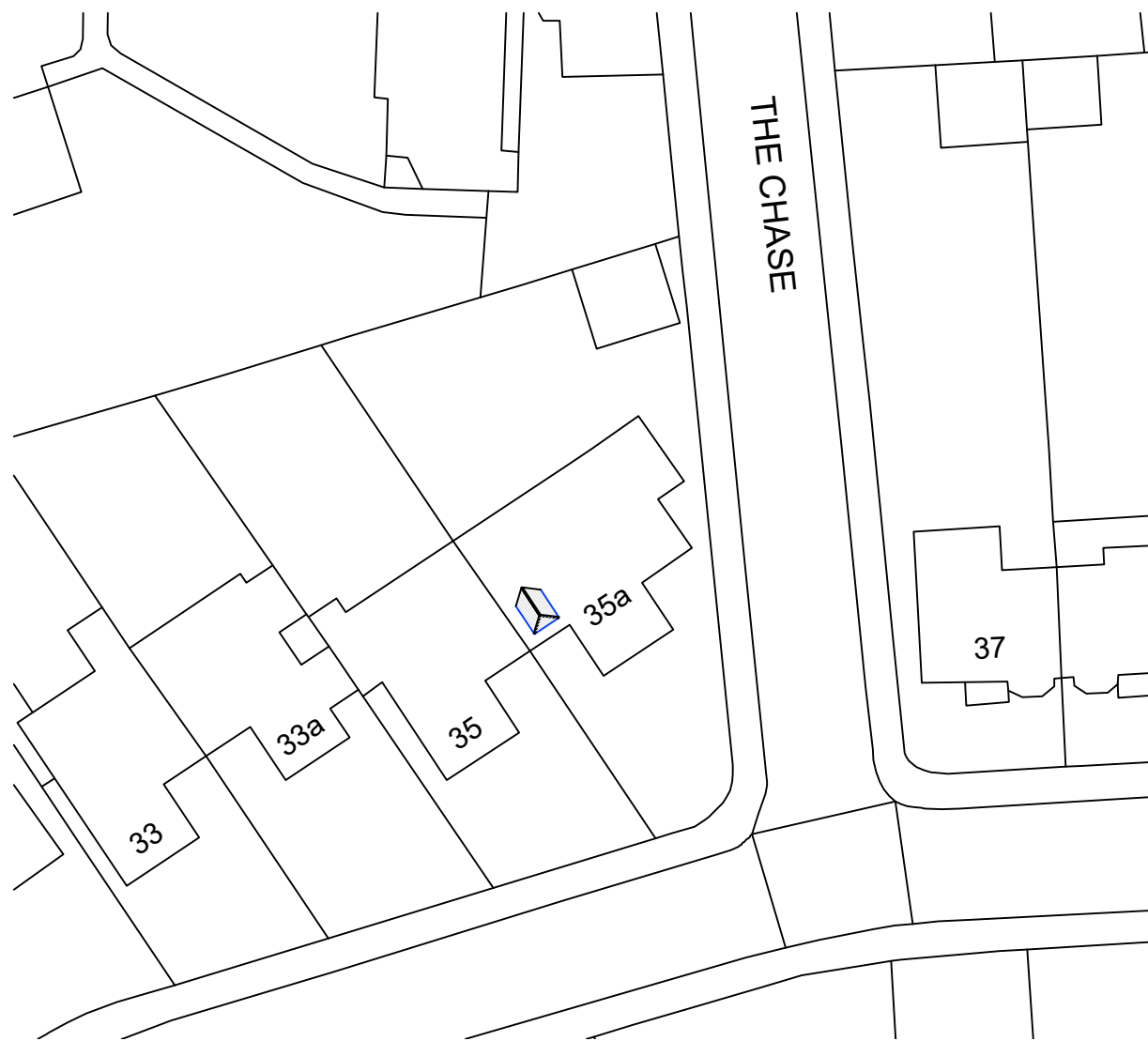
○ Block Plan 1 : 5 0 0