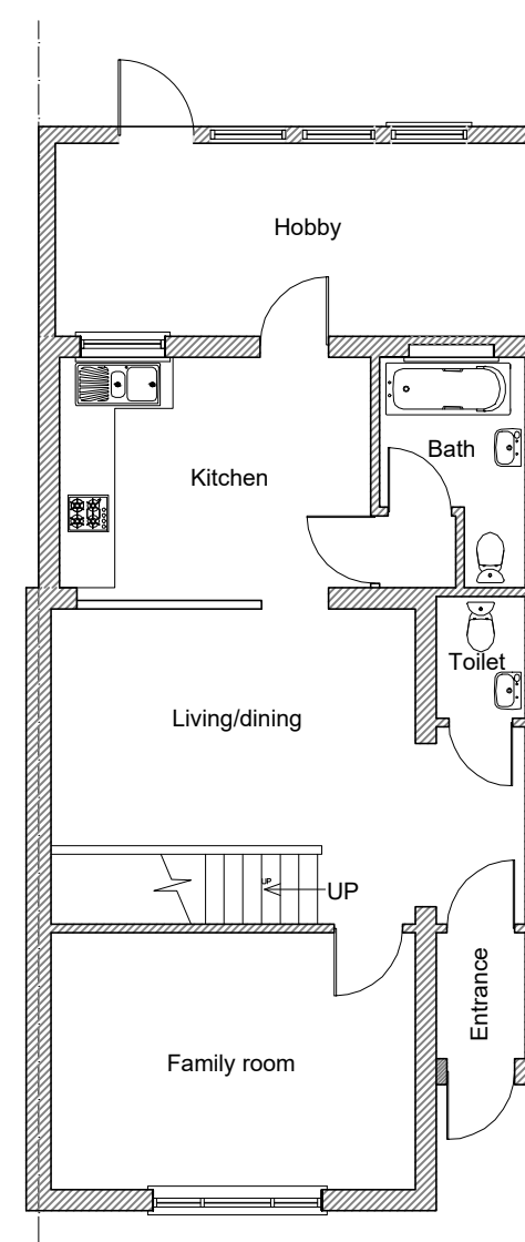
Existing Ground Floor Plan Scale 1:100