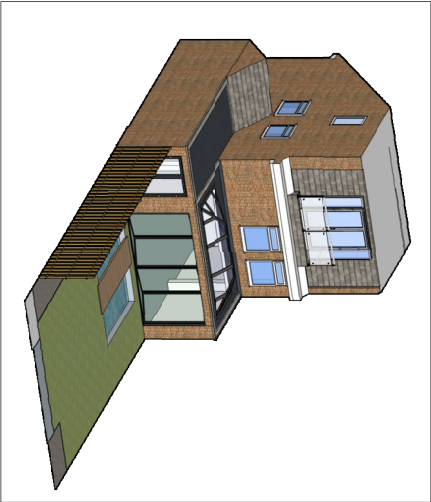
PROPOSAL EXTERIOR PLAN - 3D MODEL. NOT TO SCALE

This is not a construction drawing and must used for planning approval only, this drawings must be read in conjunction with the approved planning application and any other drawings, plans and all relevant statutory approval drawings. This drawing must not, use as a sole basis for preparing structural calculations. All dimensions wall thicknesses and structural conditions must be verified on site prior preparing structural details. Contractor and subcontractor must be notified to the supervising officer prior to producing material and commencing construction. All dimensions verified on site. All work to comply with British Standards, Code of practice. All work to be to the satisfaction of the local authority-building surveyor. All external surfaces to match existing.