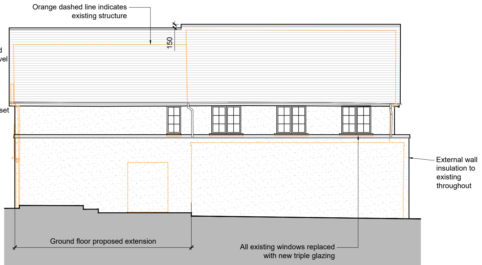
2 Proposed North Elevation