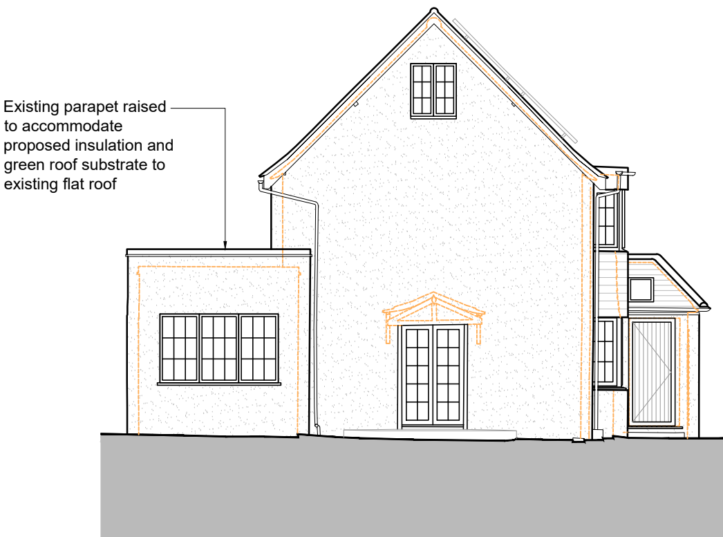
3 Proposed West Elevation