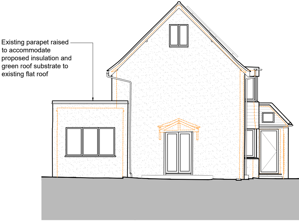
3 Proposed West Elevation