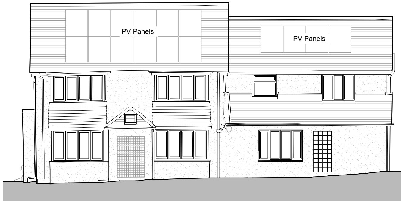
1 Existing South Elevation