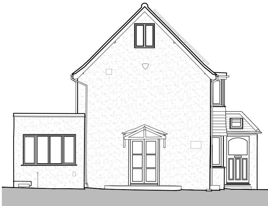
3 Existing West Elevation