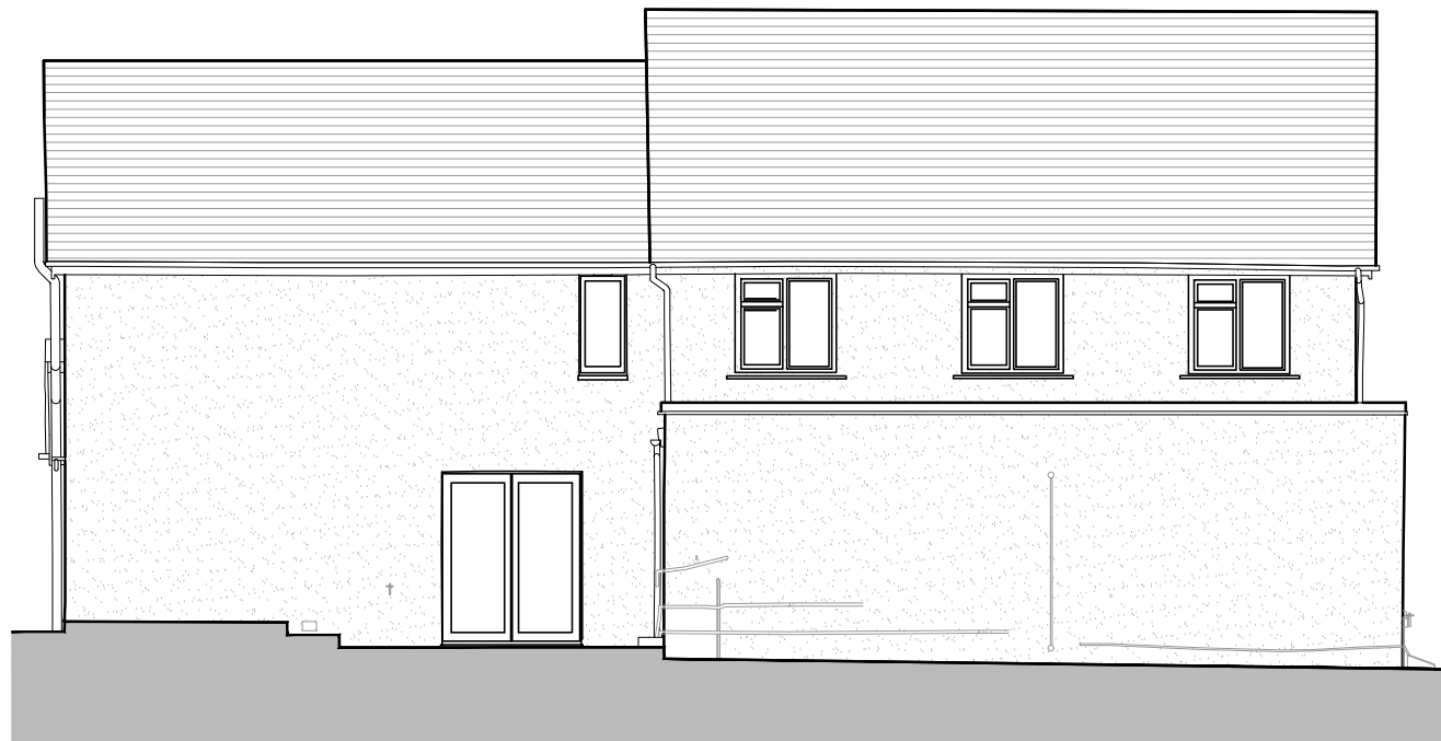
2 Existing North Elevation