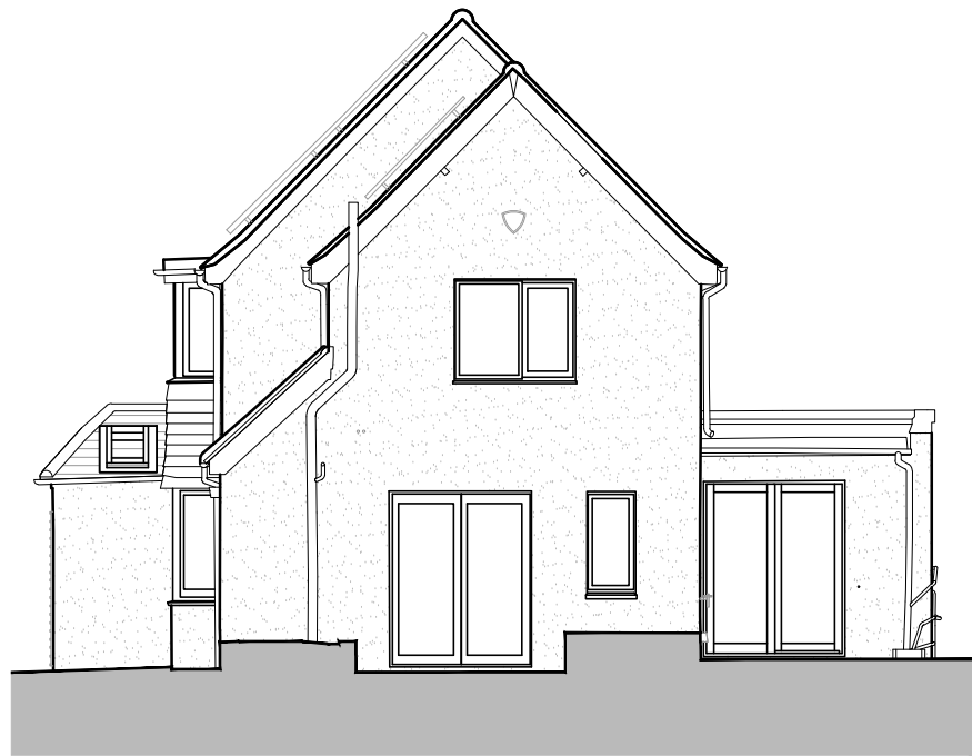
4 Existing East Elevation