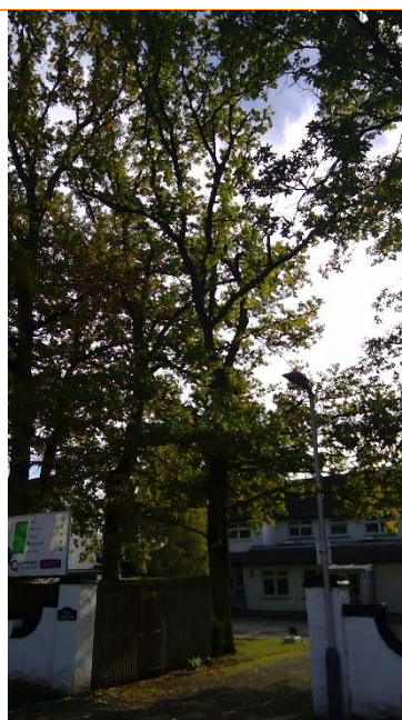
T9 - Oak