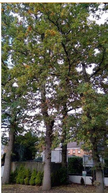
T8 - Oak