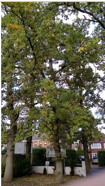
T6 - Oak