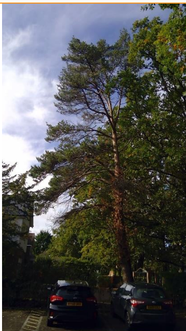
T10 - Pine (Corsican)