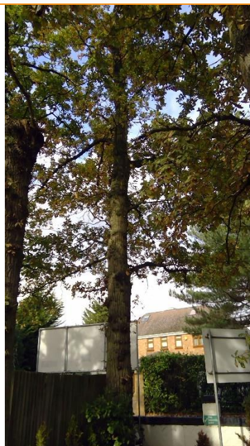
T7 - Oak