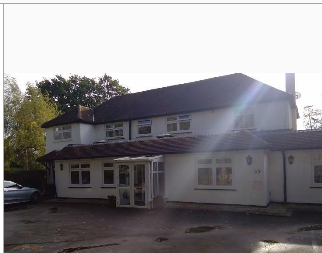
Front of property