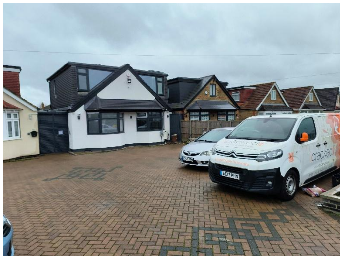
A box like structure, common to the area