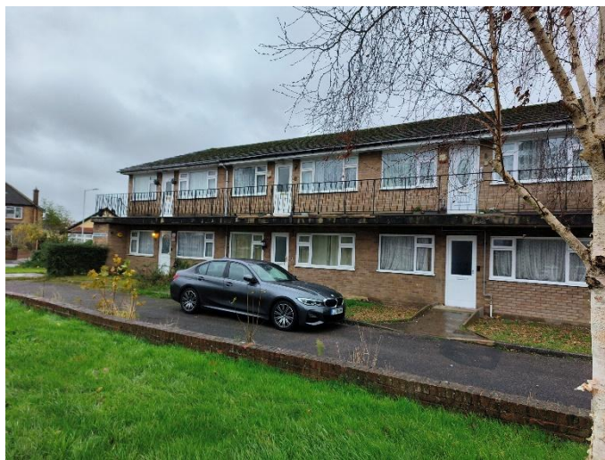
Next door oner plot with large double storey