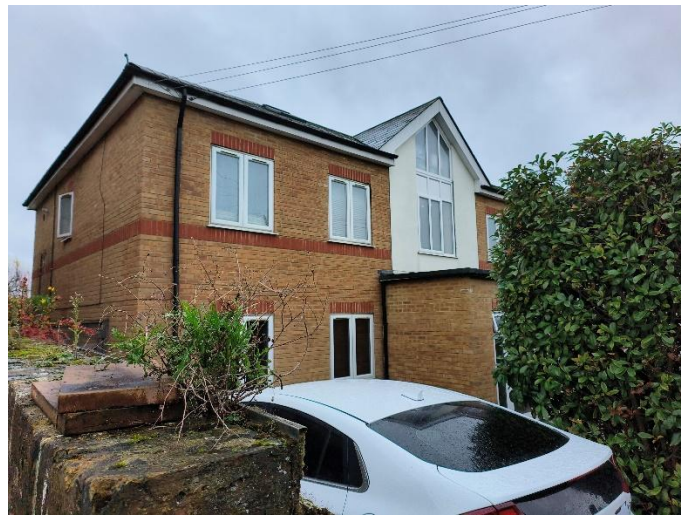
Extensions demonstrating that large buildings on corners are acceptable in the area.