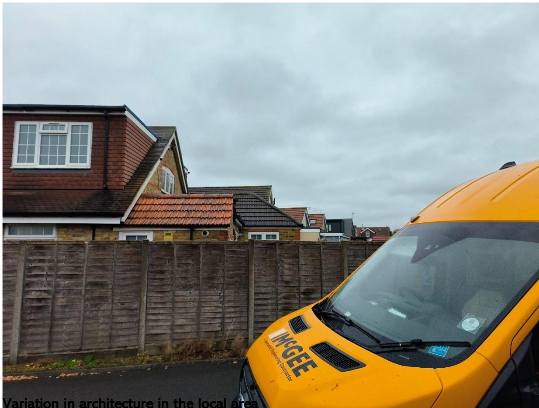
Variation in architecture in the local area

This photo shows the rear of no.48, taken from the side road Harrow View. This shows how the houses along the street stagger backwards. So the proposed extension will have even less impact on the rear of the houses along the street.