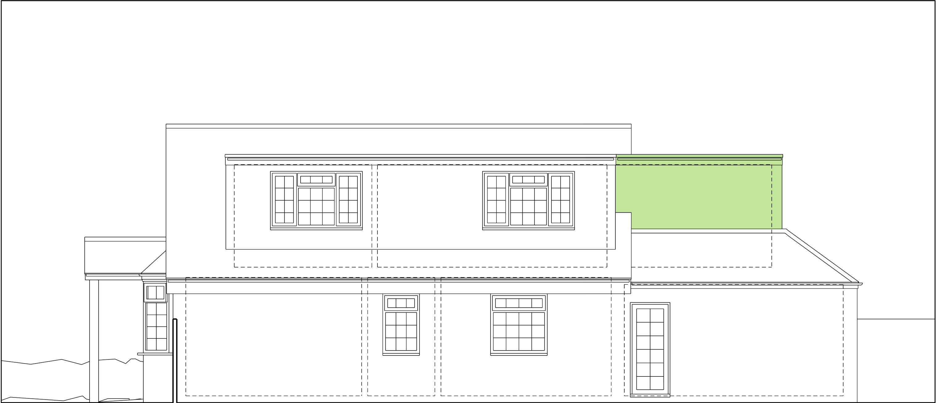
Q| PROPOSED SIDE ELEVATION