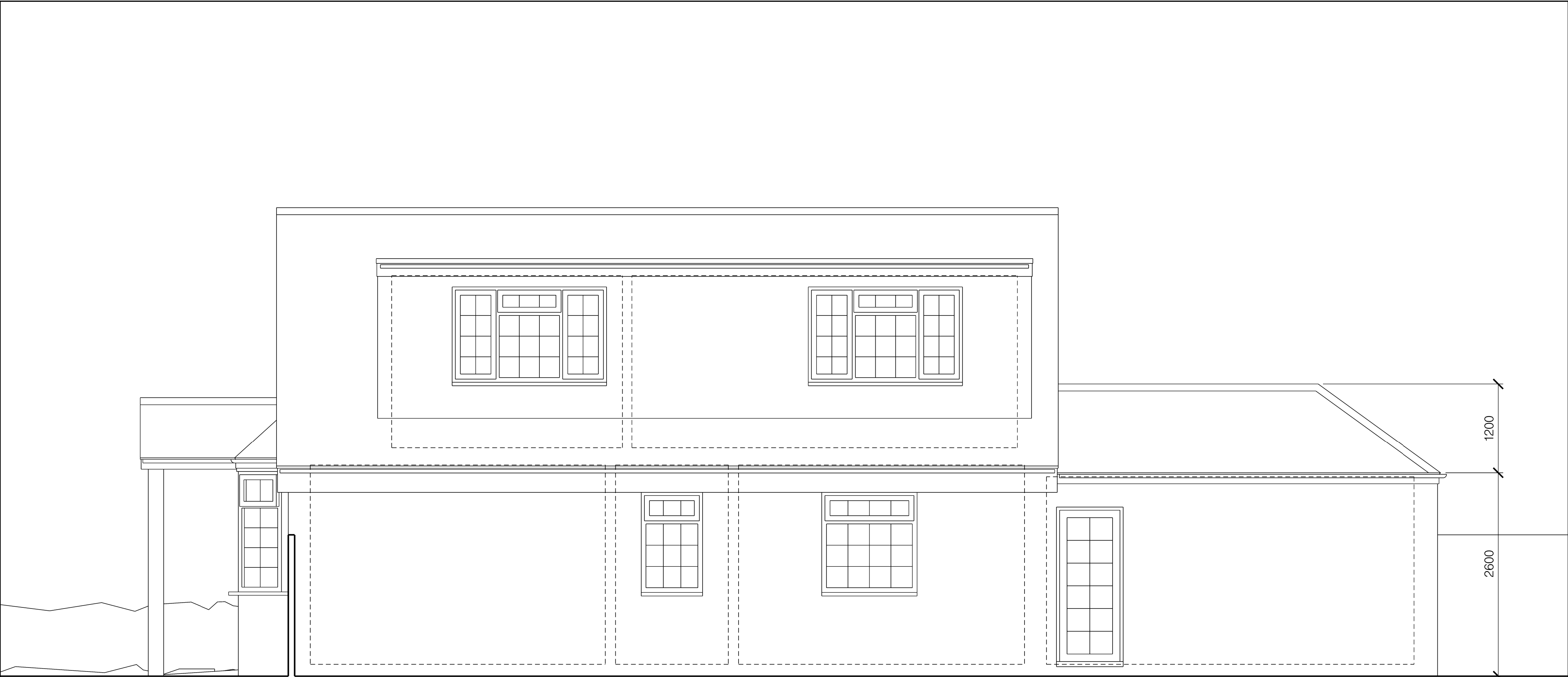
Q| EXISTING SIDE ELEVATION