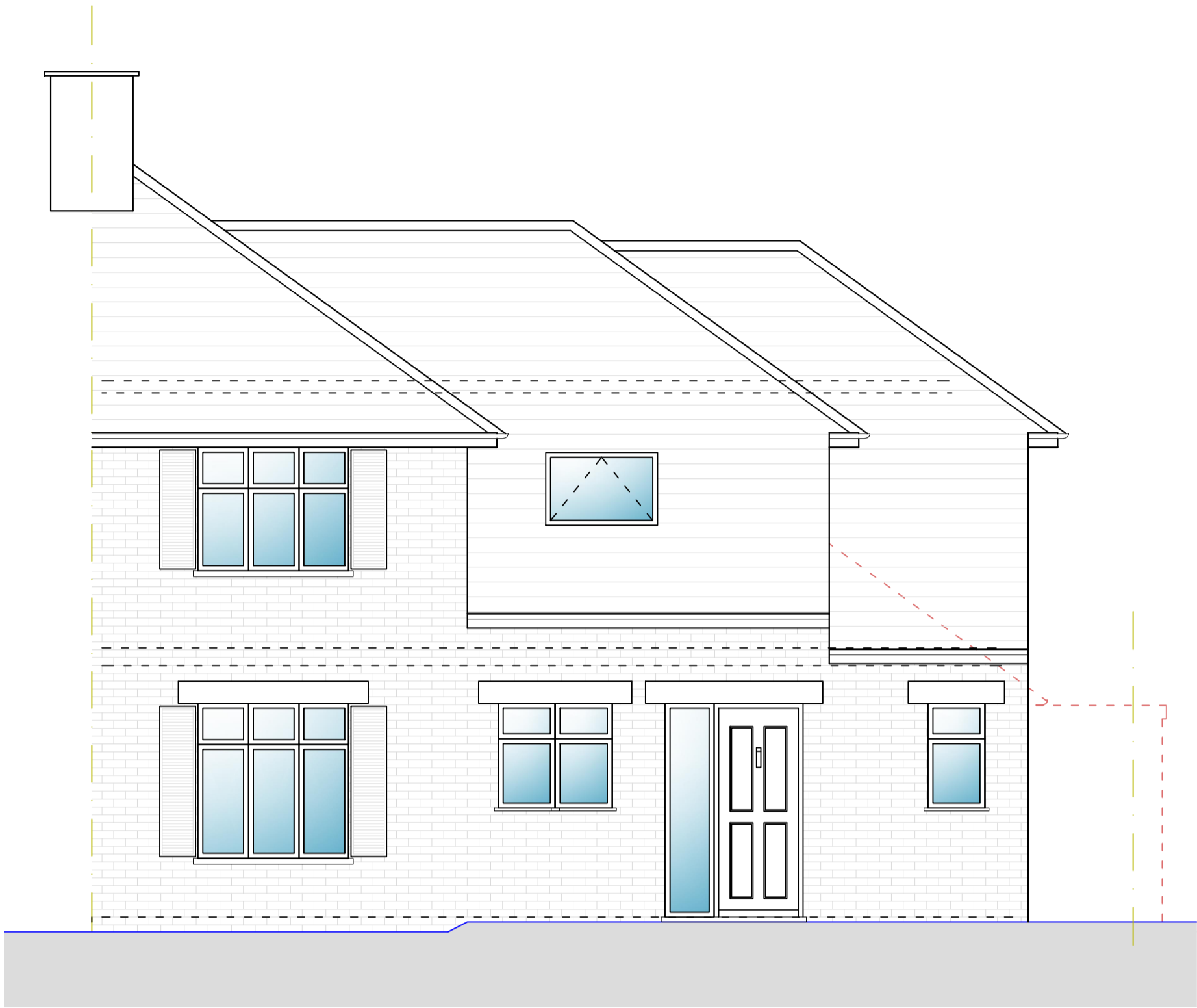
○ Front Elevation 1:50