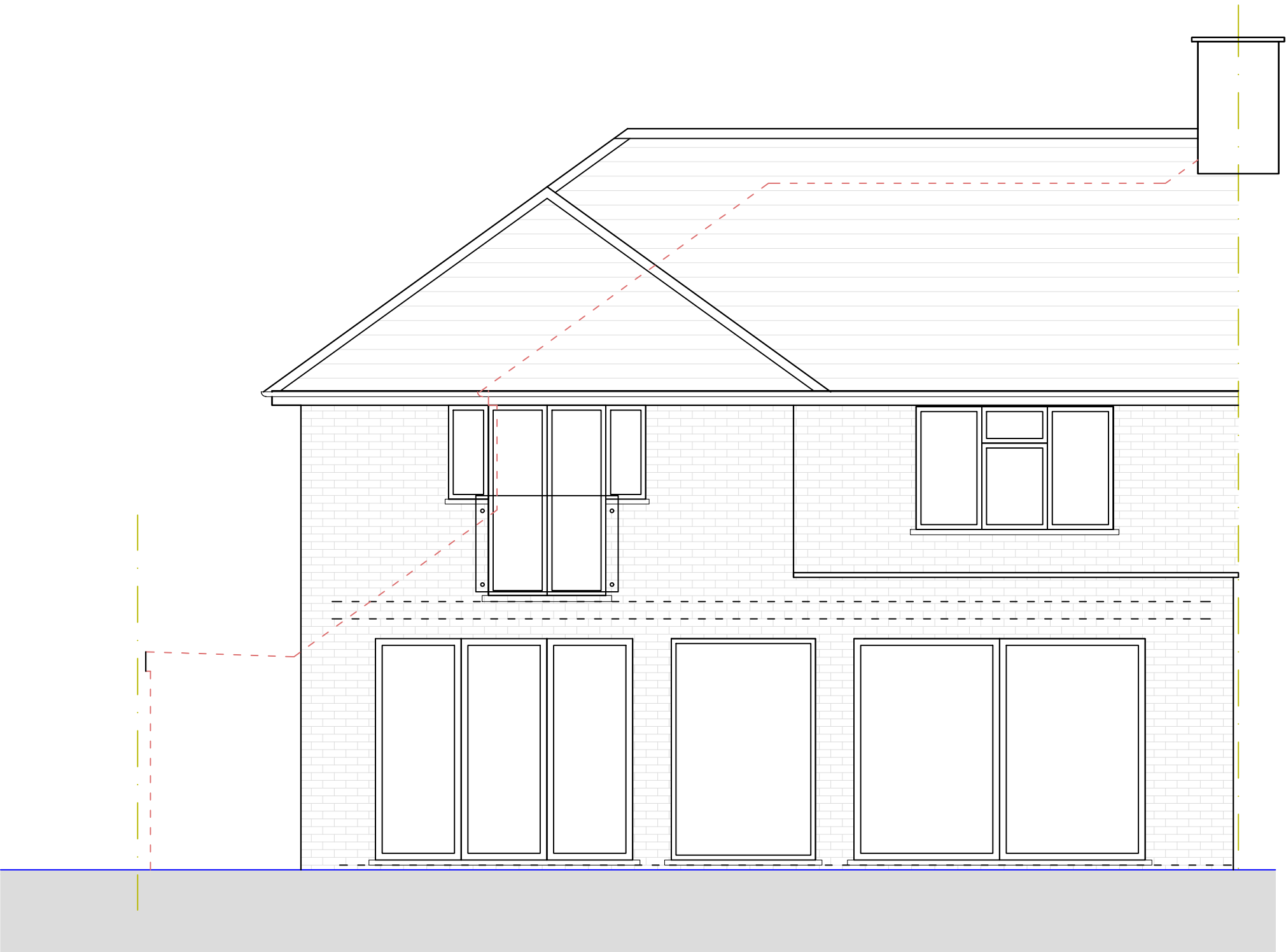
Rear Elevation 1:50