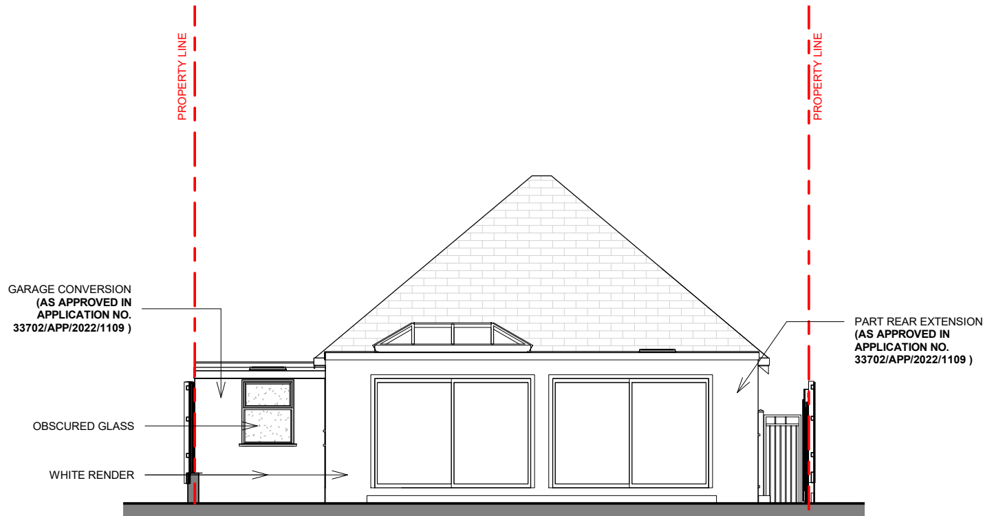
Proposed Rear Elevation 1 : 100