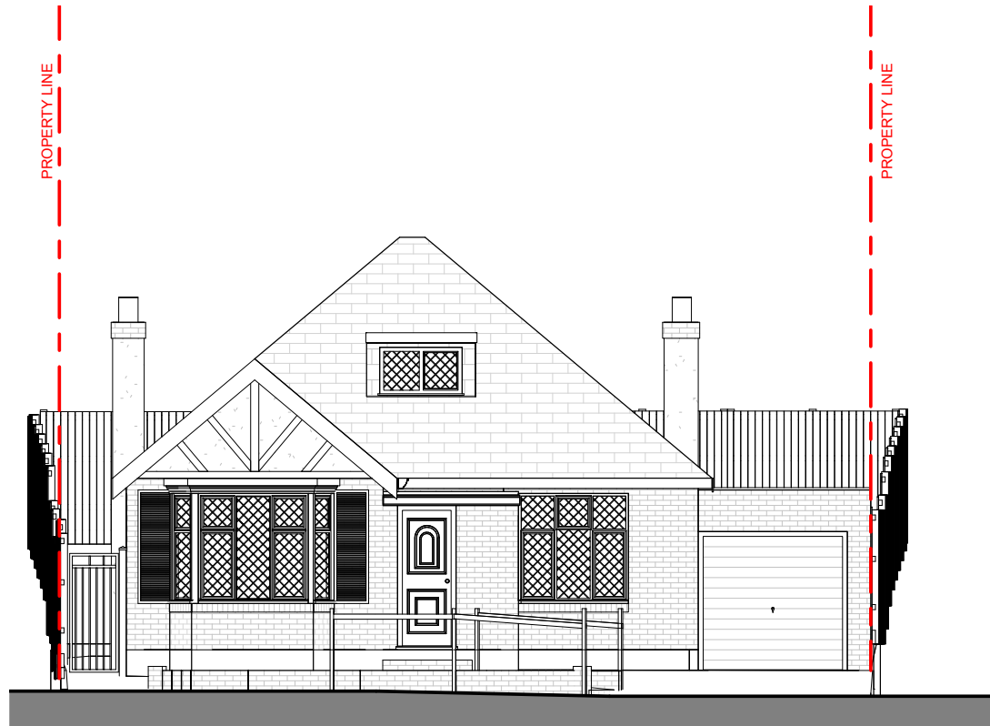
Existing Front Elevation 1 : 100