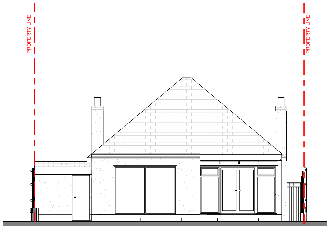
Existing Rear Elevation 1 : 100