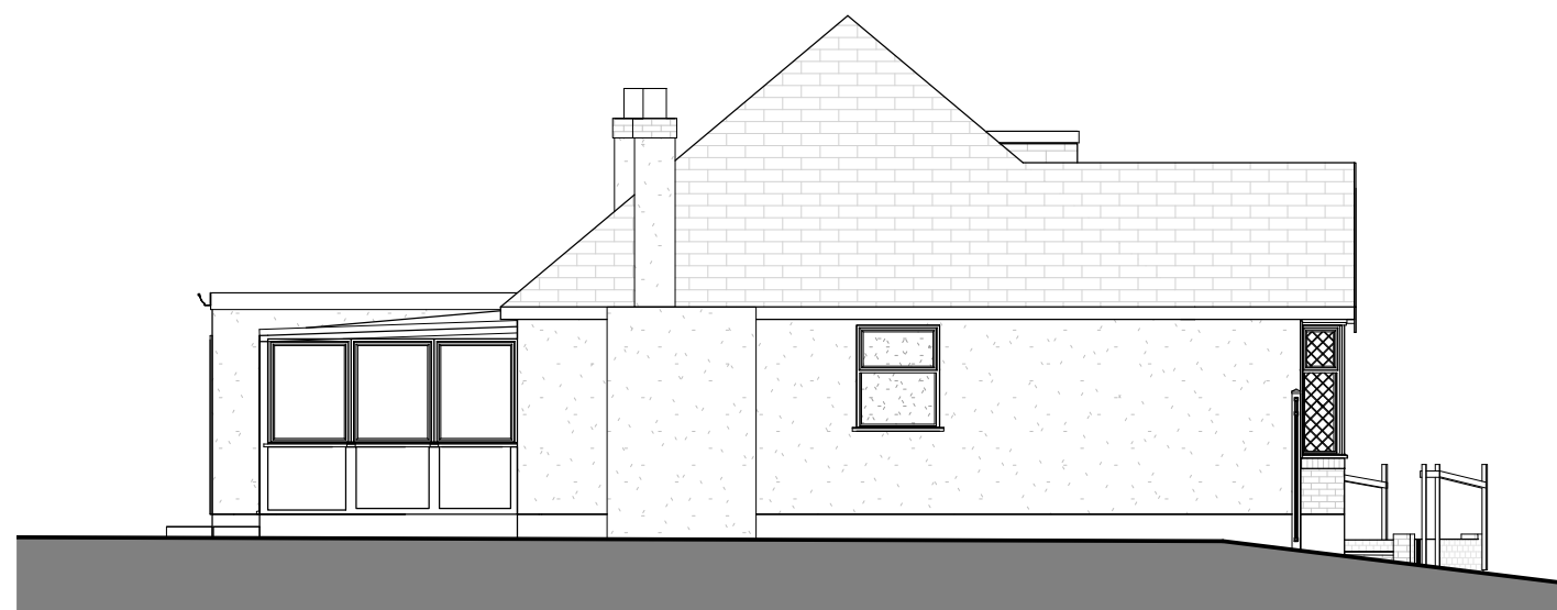
Existing Left Side Elevation 1 : 100