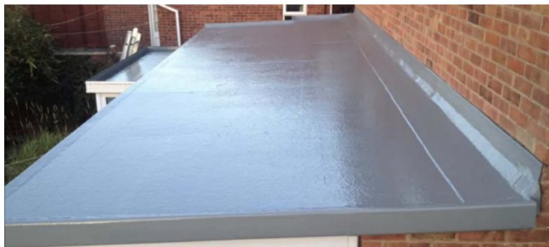
Grey GRP Roof