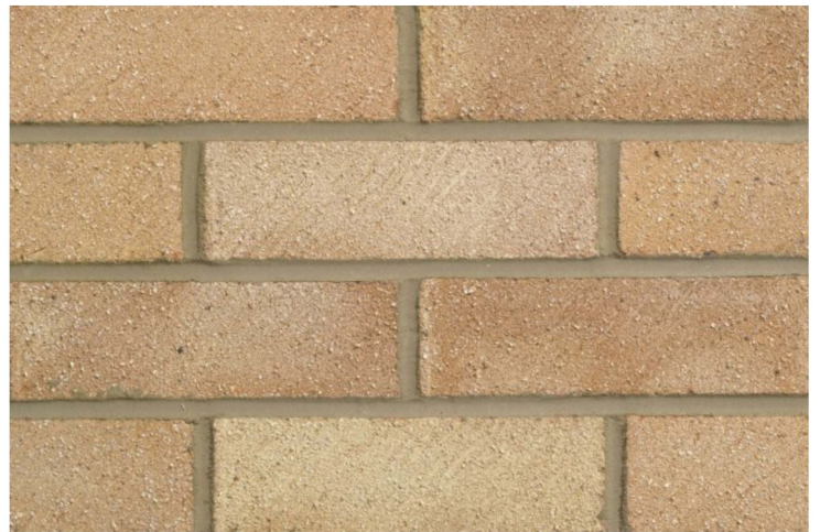
'Buff' Brick wall to match existing

Scale 1:100 0 1 2 3 4 5 Scale Bar (m) 10