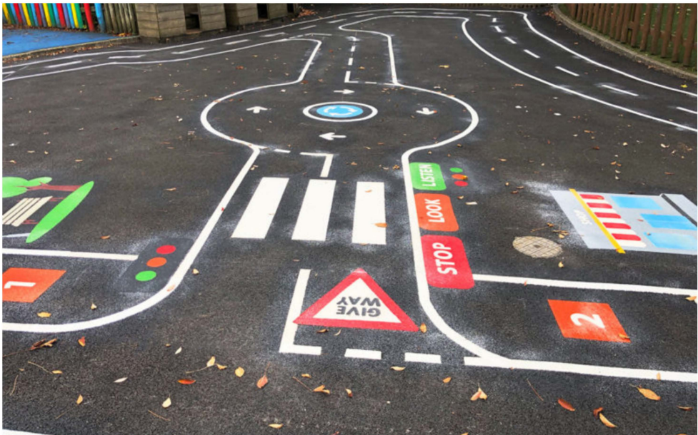
SAFETY SOFT PLAY SURFACING (Rubberised) WITH ROAD AND VARIOUS CHILD LEARNING GAMES (Similar Example)

ISSUED FOR PLANNING APPLICATION PURPOSES ONLY. NOT APPROVED FOR CONSTRUCTION.