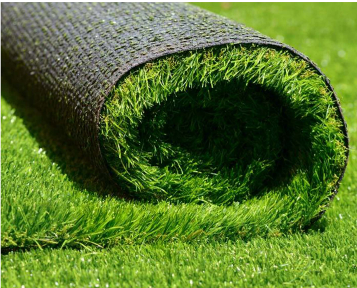
SOFT AND NON-ABRASIVE WITH A THICK & DENSE PILE FOR SMALL CHILDREN USE.