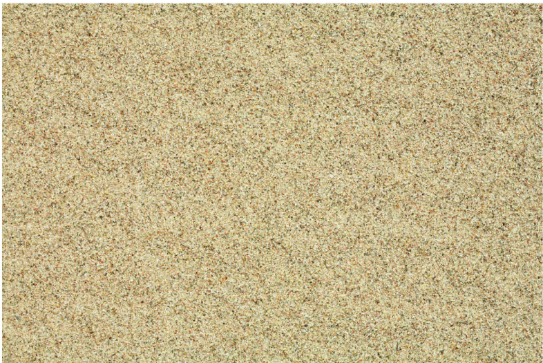
CHILDREN'S TIMBER WET / SAND PLAY BENCH IN ON PLAY PIT SAND