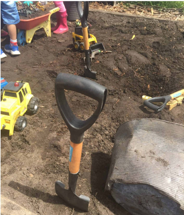
CHILDREN'S TIMBER 'MUD KITCHEN' ON MUD