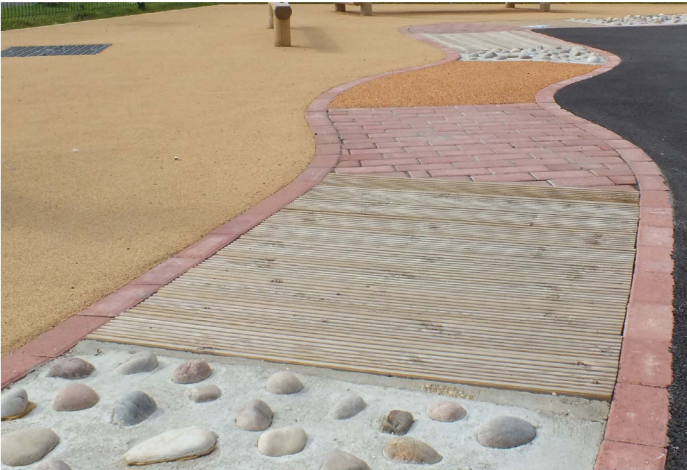
PATH WITH VARIOUS TEXTURED SURFACES. (Similar Example)