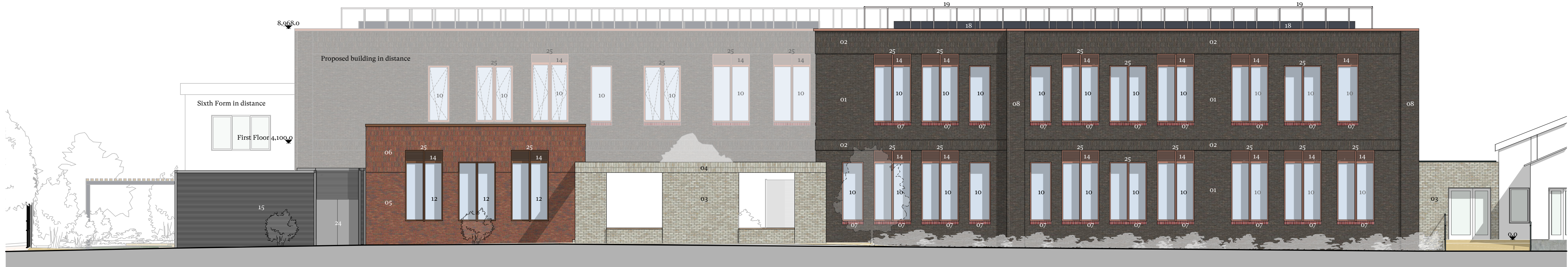
A West Elevation 1:100 Scale 1:100