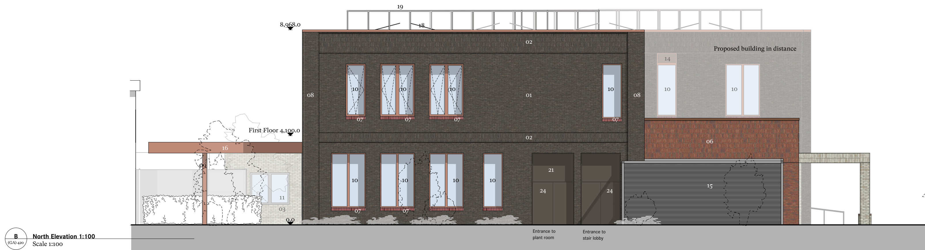
B North Elevation 1:100 Scale 1:100