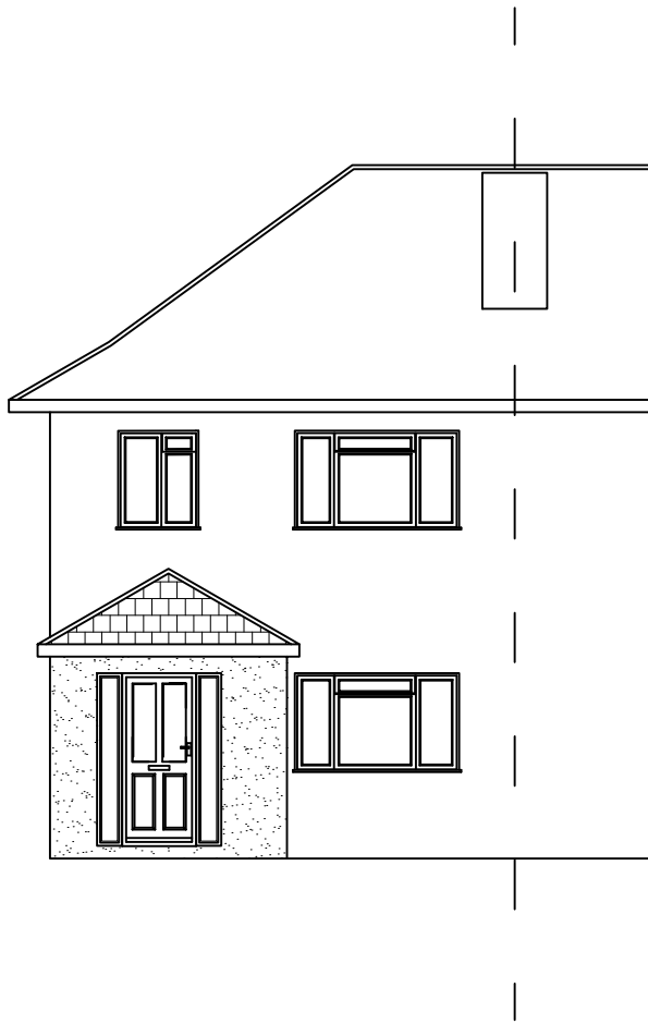
1 Proposed Front Elevation