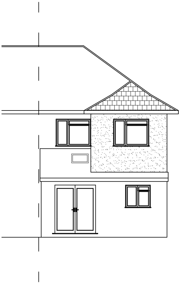
2 Proposed Rear Elevation