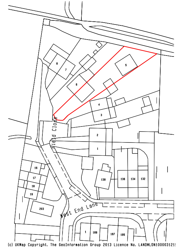
1:1250 LOCATION PLAN