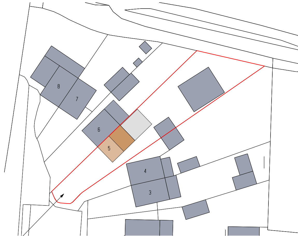
1:500 SITE PLAN

EXISTING VEHICULAR ACCESS AND DRIVEWAY PARKING AREA FOR AT LEAST 5 CARS