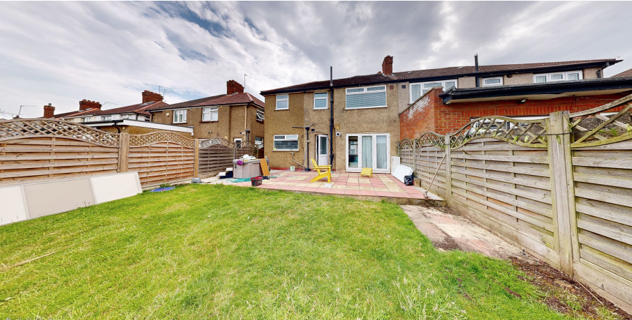
2 - Rear elevation including no.24