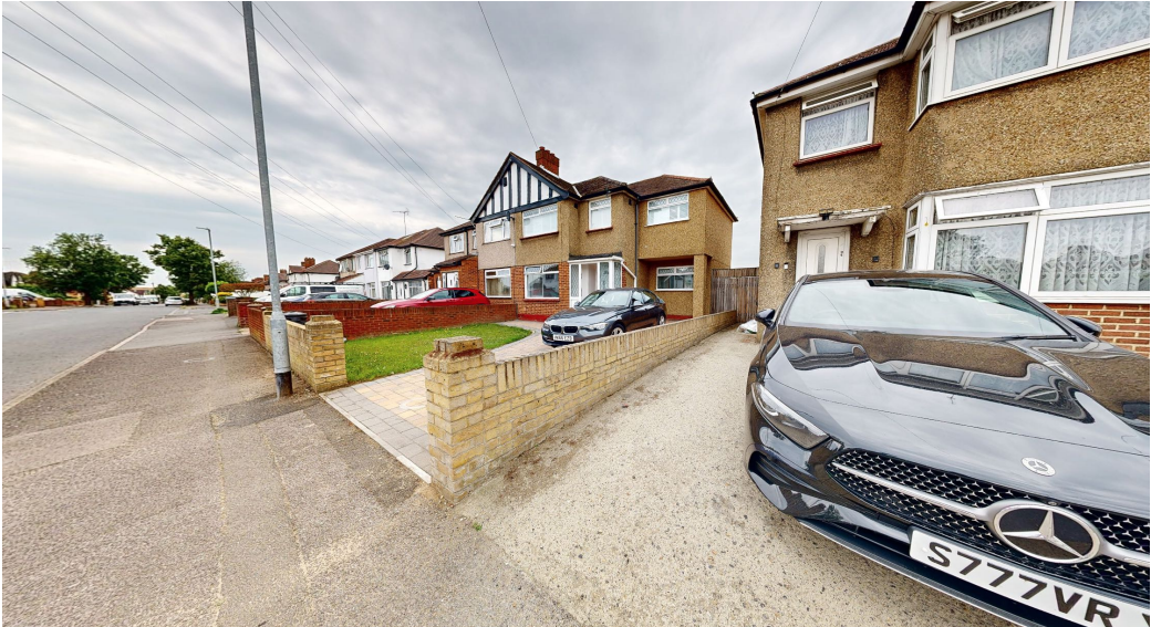
3 - Front Elevation