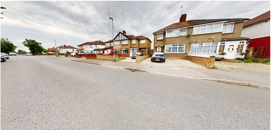
5 - Mildred Avenue Street Elevation