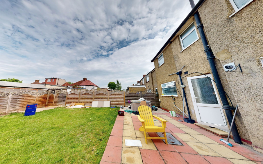
4 - Side Elevation