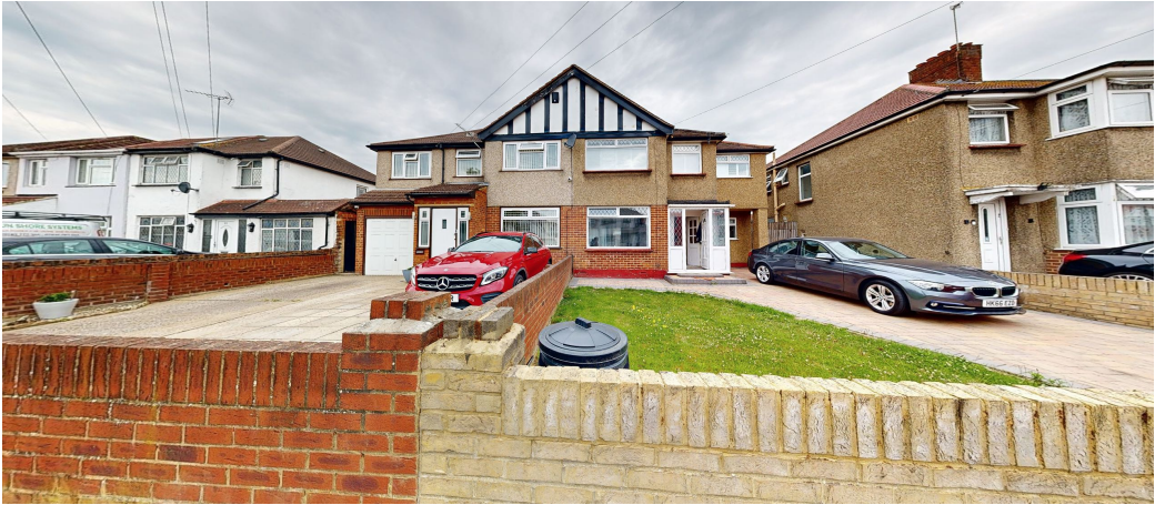
1 - House Entrance