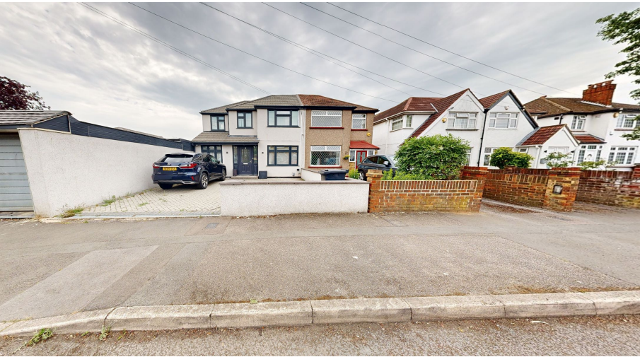
6 - No.13 Mildred Avenue