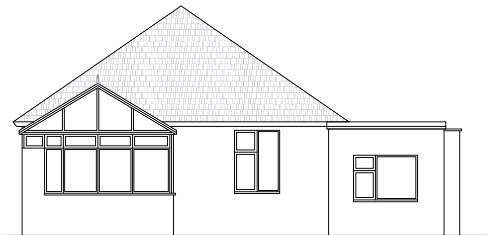
EXISTING AND PROPOSED REAR ELEVATION