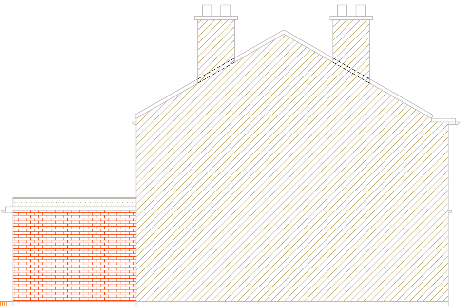
EXISTING SIDE ELEVATION-2