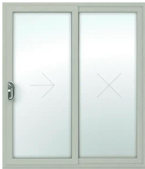
ALUMINIUM GLAZED DOORS & WINDOWS COLOUR TO BE THE SAME AS THE CLADDING (DULUX PEWTER PEARL SATIN 97188202)

The new third floor storey comprises of elegant flush framed full height glazed windows and dormers within the existing pitched roof. The existing roof tile will be cleaned and kept as it is. The new dormer will be aluminium cladding with full length doors, colour to be light grey (Dulux Pewter Pearl Satin 97188202). A sample of the cladding will be submitted to the planning department.