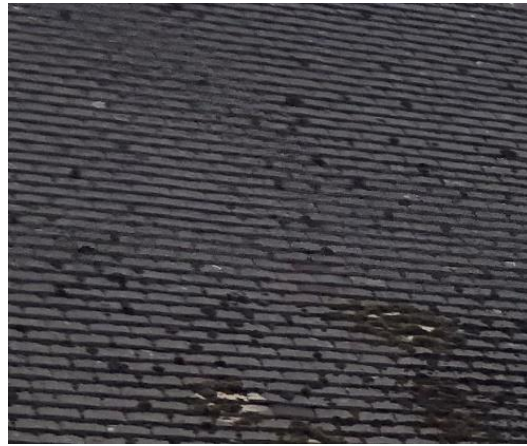
EXISTING TILE ROOF TO BE CLEANED AND ANY BROKEN TILE TO BE REPLACED LIKE FOR LIKE