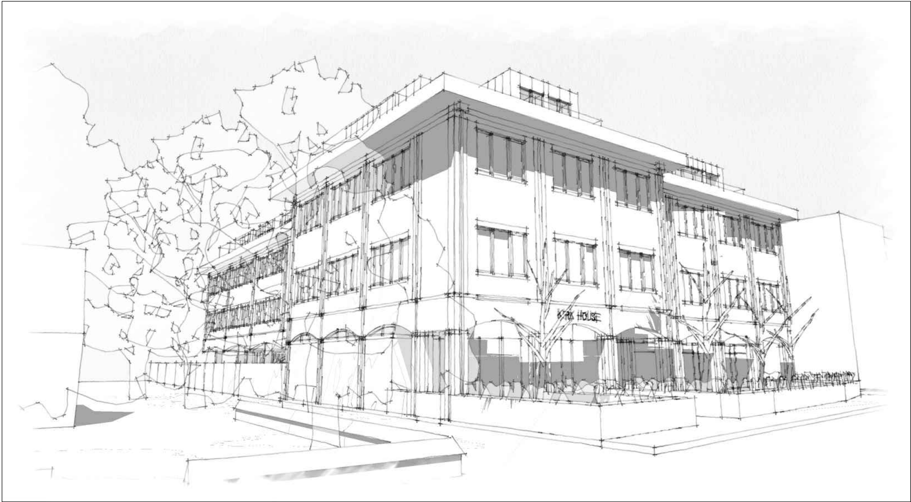
PROPOSED 3D IMAGE 1