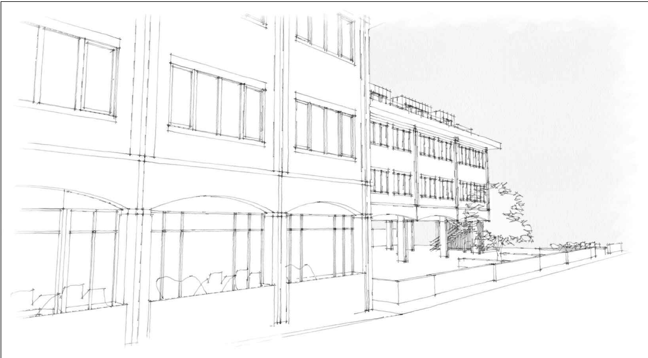
PROPOSED 3D IMAGE 3