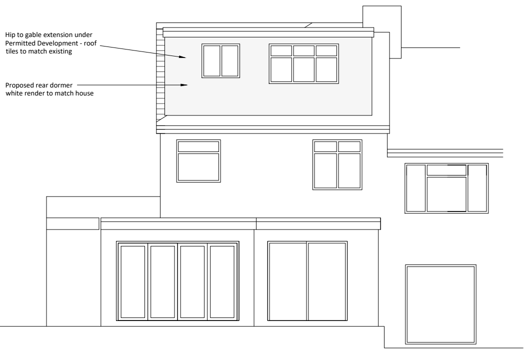
REAR ELEVATION - PROPOSED