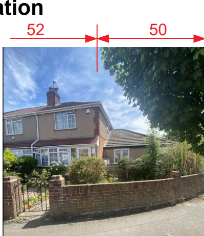
Side Elevation (West)