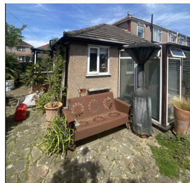
Side Elevation (East)