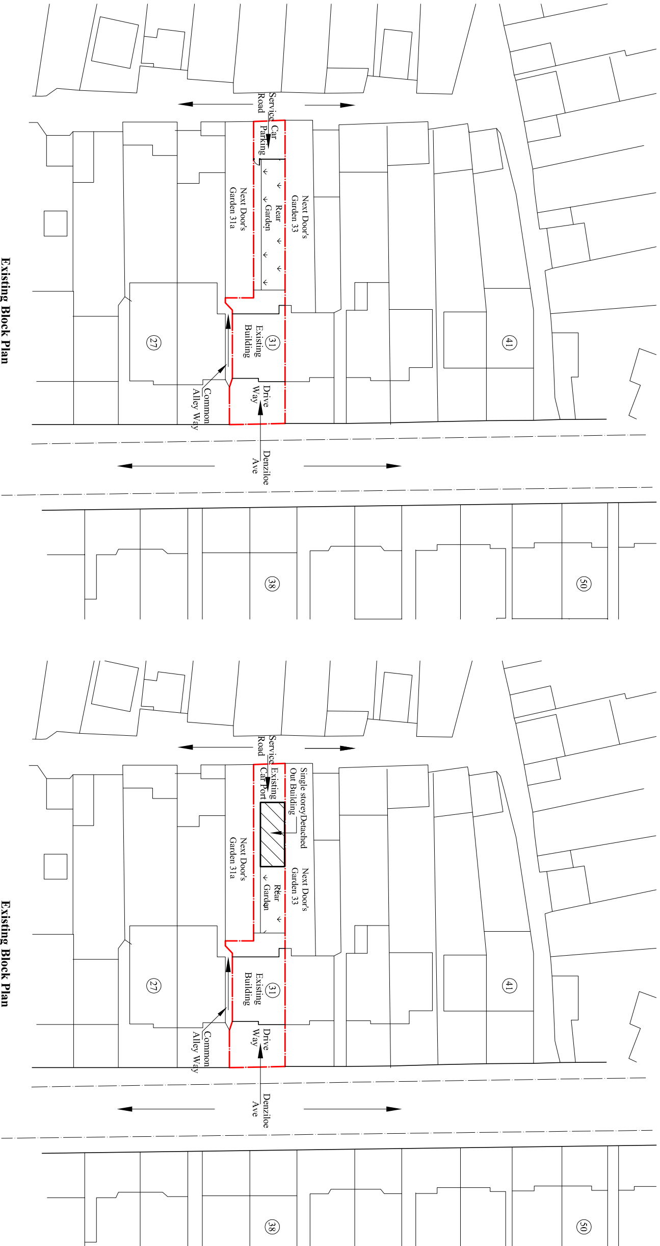
Existing Block Plan Scale:1:500 ○ = Trees