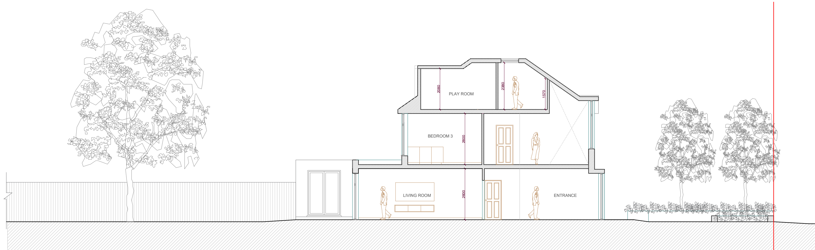
02 PROPOSED SECTION Scale 1:100