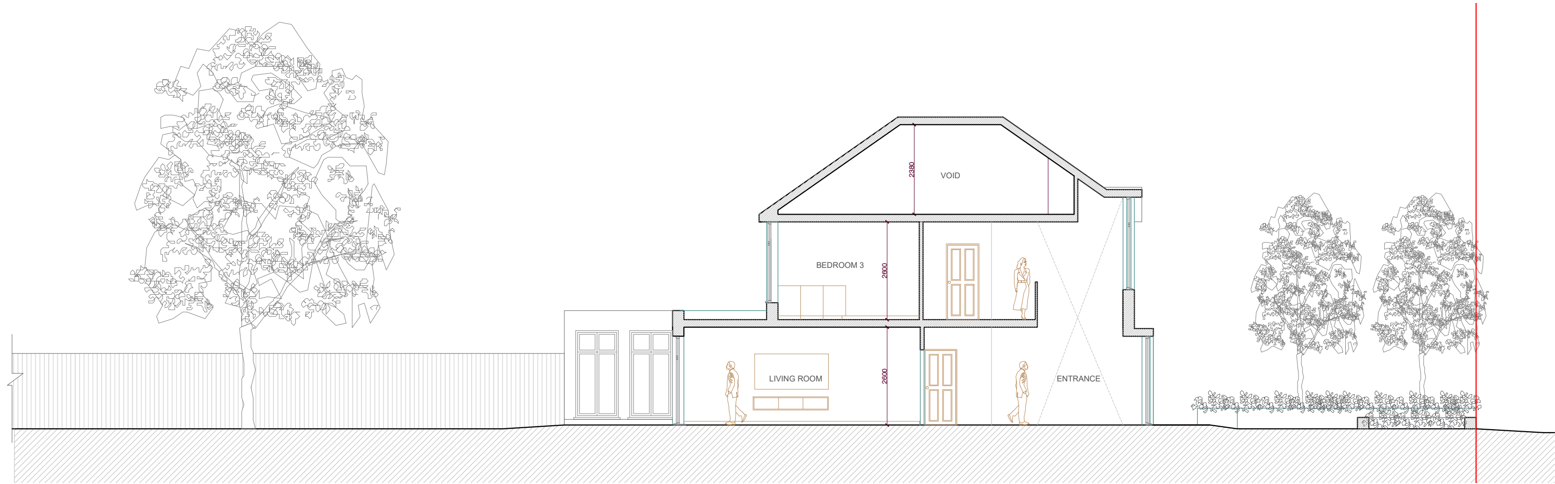
01 APPROVED SECTION SCALE 1:100