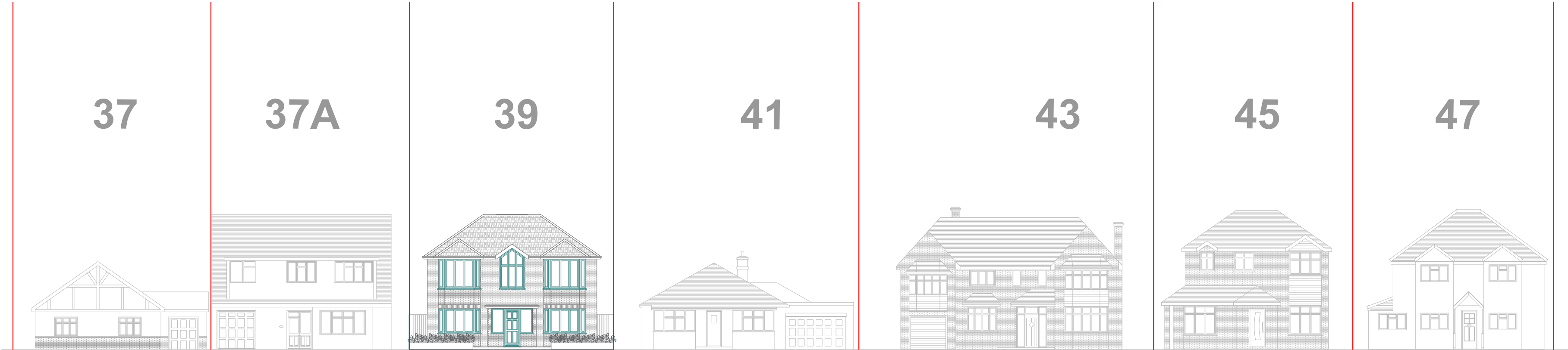
02 PROPOSED STREET ELEVATION SCALE 1:200