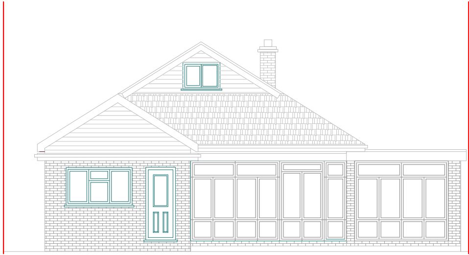
01 EXISTING REAR ELEVATION Scale 1:100