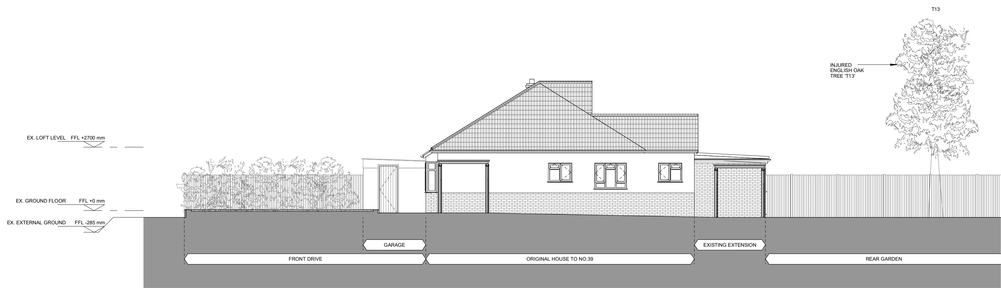
4 20045 - EXISTING NORTH WEST ELEVATION 1 : 100