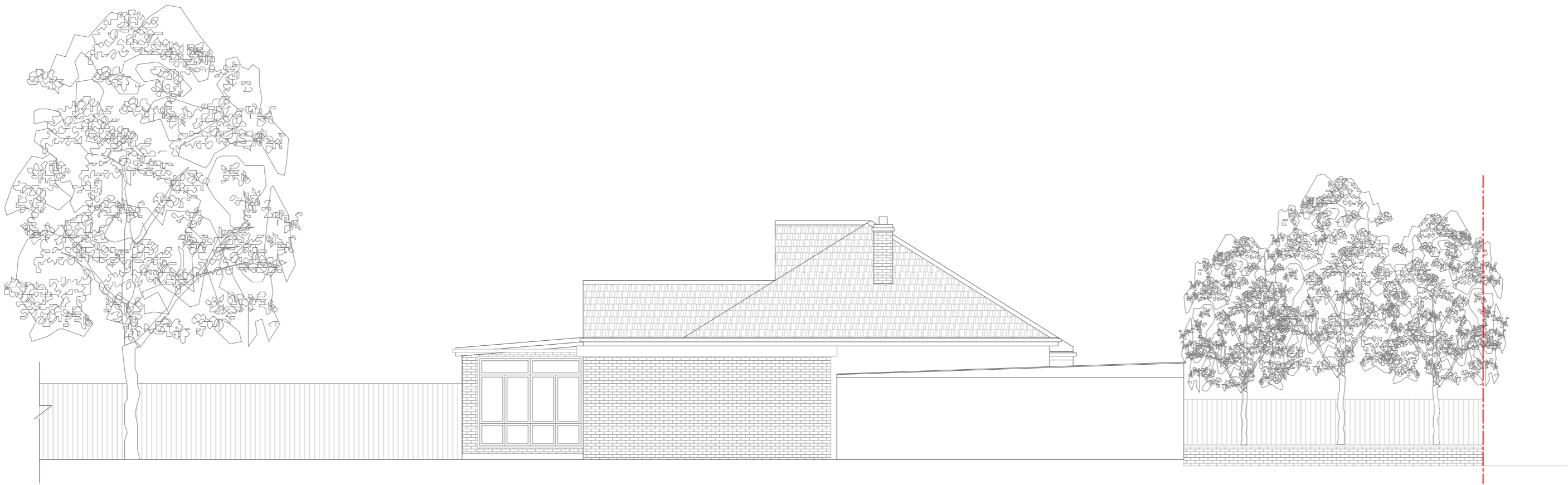
01 EXISTING SIDE ELEVATION Scale 1:100

DO NOT SCALE DIMENSIONS OFF THIS DRAWING. CHECK ALL DIMENSIONS ON SITE BEFORE FABRICATION. FINAL COORDINATION AND CHECKS ARE RESPONSIBILITY OF THE SITE TEAM TO SUIT CONDITIONS AND TOLERANCES BEFORE ANY INSTALLATION. REPORT ALL ERRORS OR OMISSIONS TO AA8 DESIGNS. THIS DRAWING IS PROTECTED UNDER COPYRIGHT AND SHALL NOT BE REPRODUCED IN PART OR WHOLE WITHOUT PRIOR EXPRESSED PERMISSION OF AA8 DESIGNS.