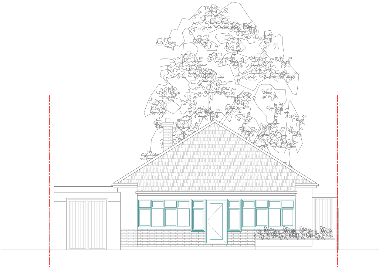
01 EXISTING FRONT ELEVATION Scale 1:100

DO NOT SCALE DIMENSIONS OFF THIS DRAWING. CHECK ALL DIMENSIONS ON SITE BEFORE FABRICATION. FINAL COORDINATION AND CHECKS ARE RESPONSIBILITY OF THE SITE TEAM TO SUIT CONDITIONS AND TOLERANCES BEFORE ANY INSTALLATION. REPORT ALL ERRORS OR OMISSIONS TO AA8 DESIGNS. THIS DRAWING IS PROTECTED UNDER COPYRIGHT AND SHALL NOT BE REPRODUCED IN PART OR WHOLE WITHOUT PRIOR EXPRESSED PERMISSION OF AA8 DESIGNS.