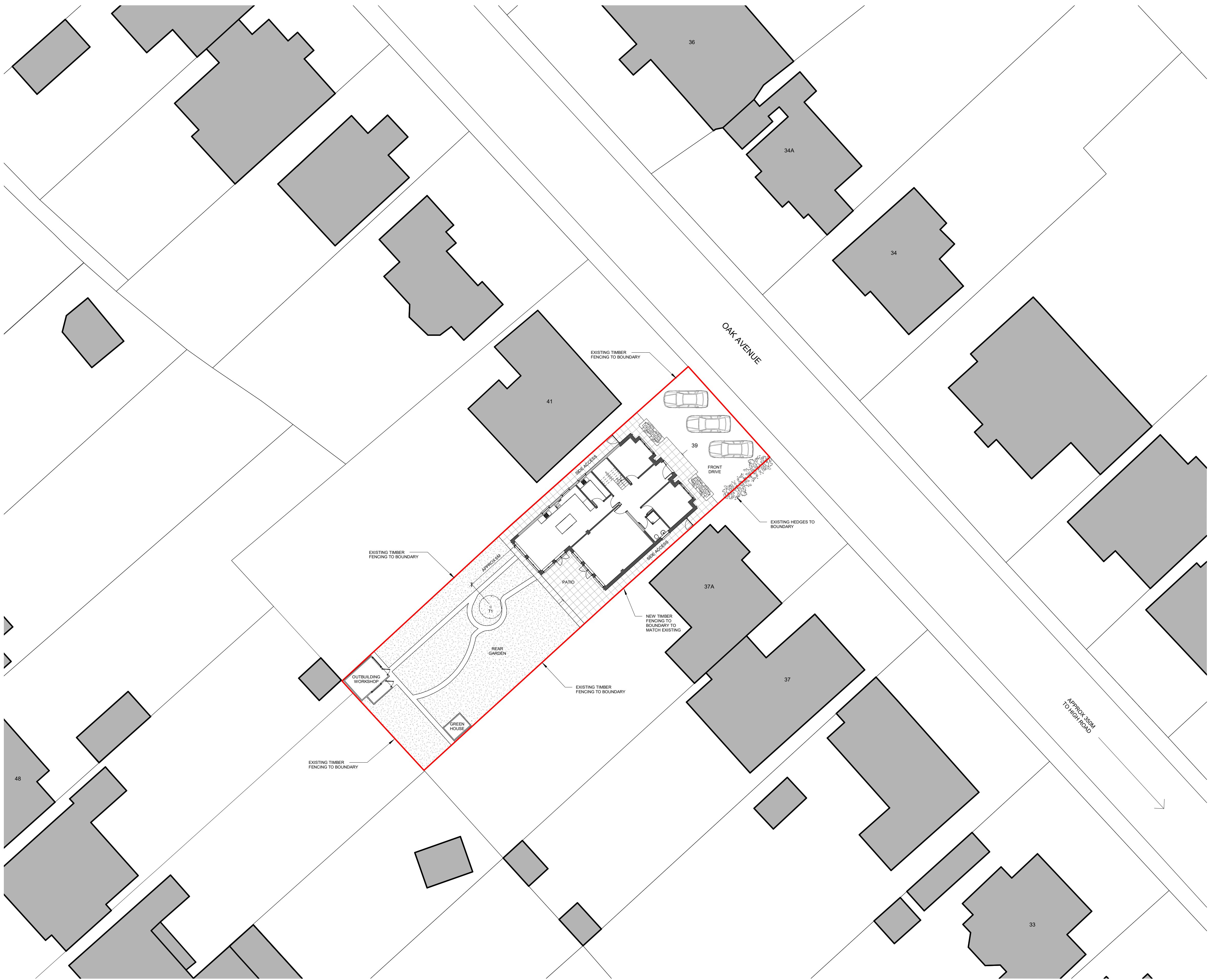
1 20045 - EXISTING SITE PLAN 1 : 200