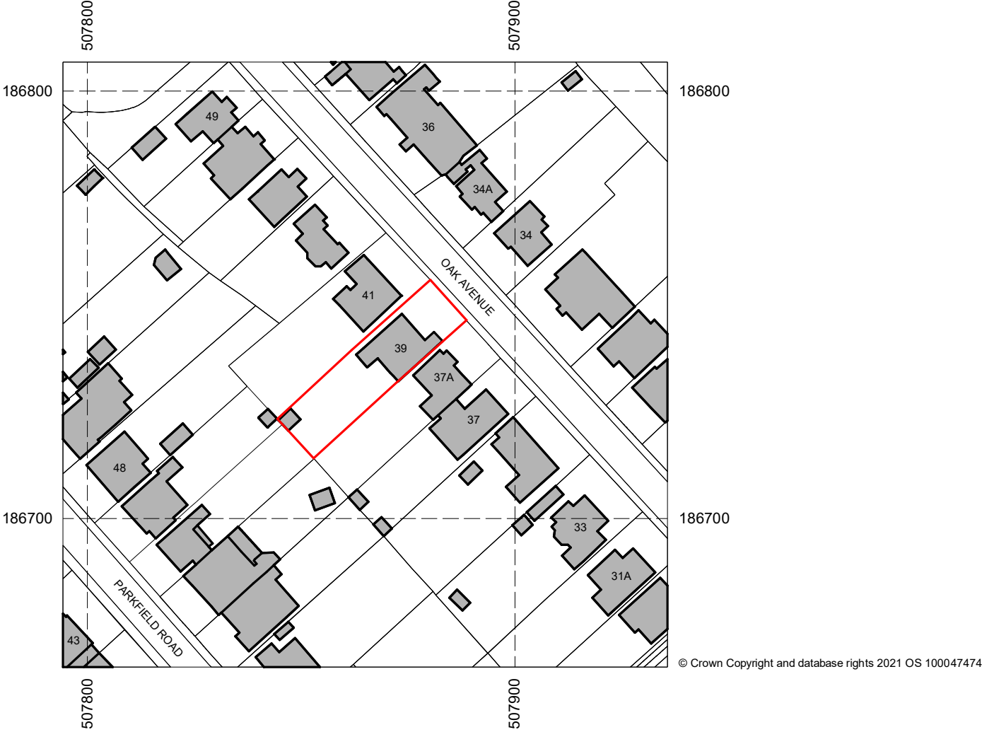
1 20045 - LOCATION PLAN 1 : 1250