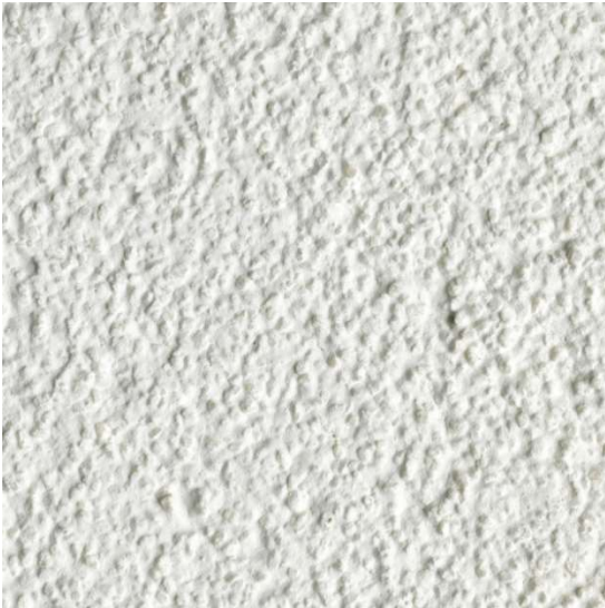
White rendered to 1 st floor walls.