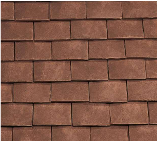
Red / brown roof tiles to match existing.