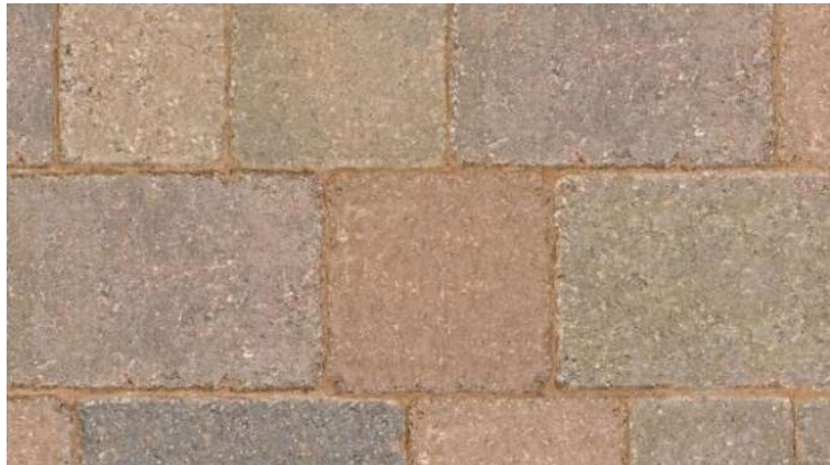
Alpha Brindle paving