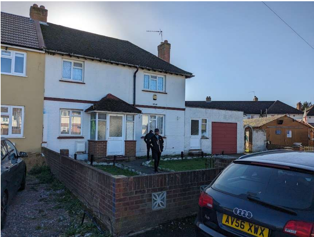
View of front of the property