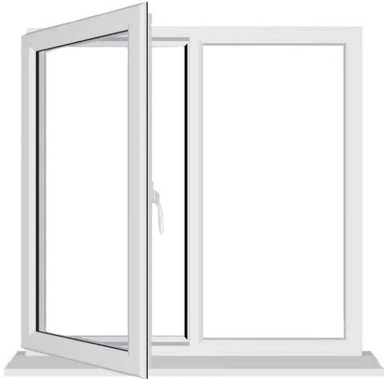
White UPVC windows