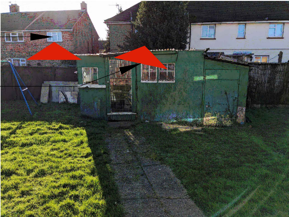
Photograph - view to the rear of East Road

NOTE THIS DRAWING IS TO BE READ IN CONJUNCTION WITH ALL OTHER RELEVANT DRAWINGS AND SPECIFICATIONS THIS DRAWING HAS BEEN PREPARED FOR IDENTIFICATION PURPOSES ONLY. VERIFICATION OF DRAWN INFORMATION TO BE CARRIED OUT BY CONTRACTOR PRIOR TO OTHER USE.