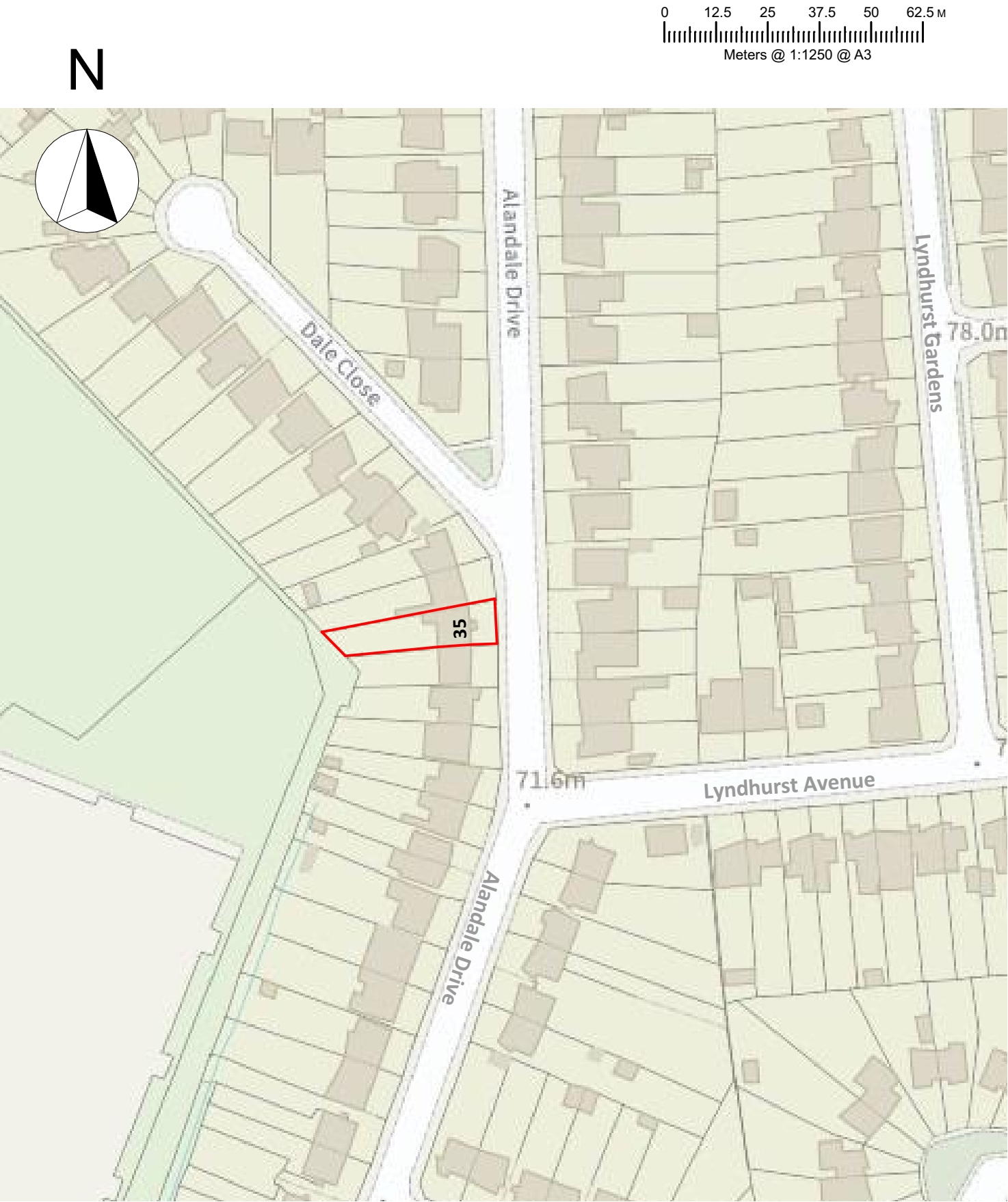
LOCATION MAP scale 1:1250