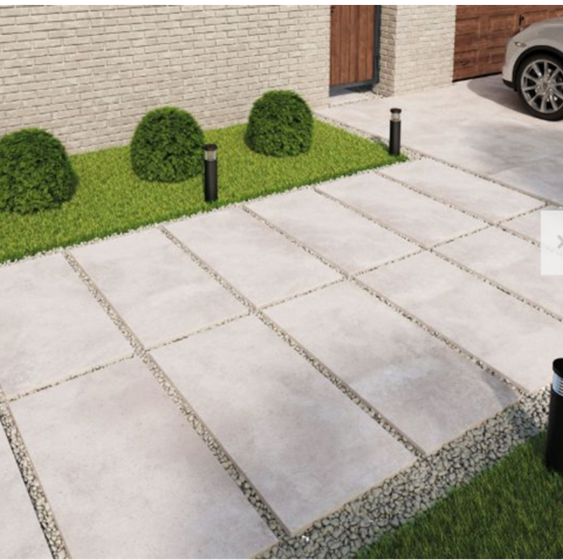
Earth 60x120 cm XL White Paving Slabs

Channel drain discharge surface water to the main drain as approved by Thames Water