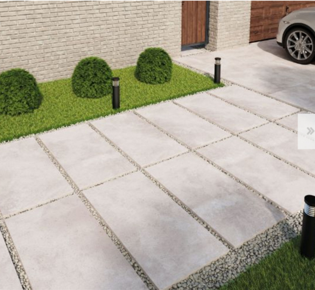
Earth 60x120 cm XL White Paving Slabs

Channel drain discharge surface water to the main drain as approved by Thames Water