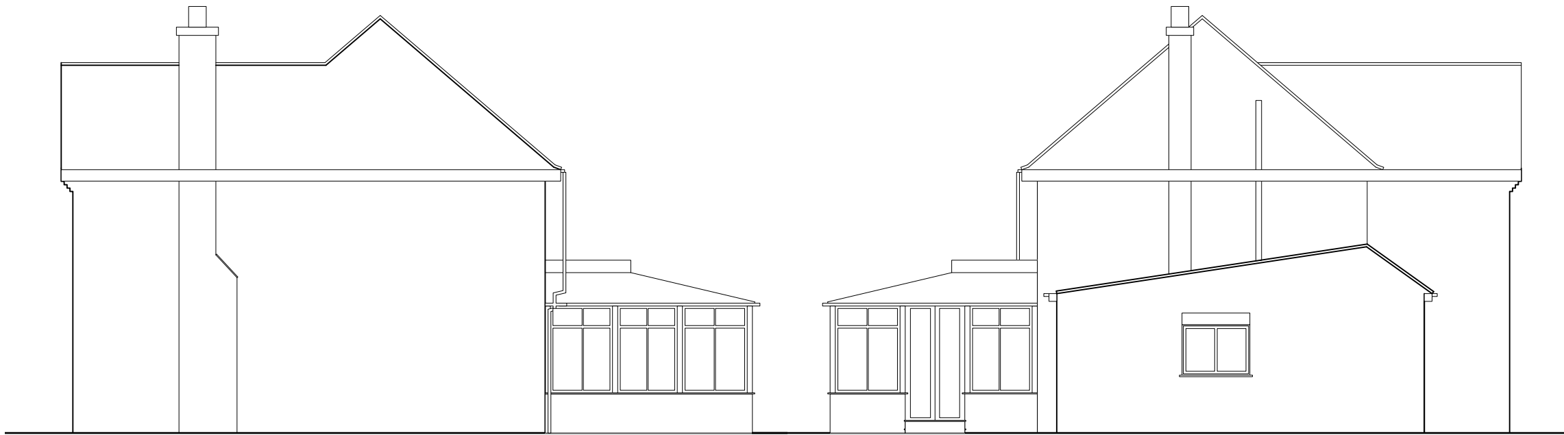
2 NORTH Scale: 1:100