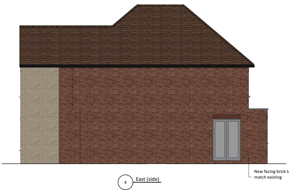
4 East (side)