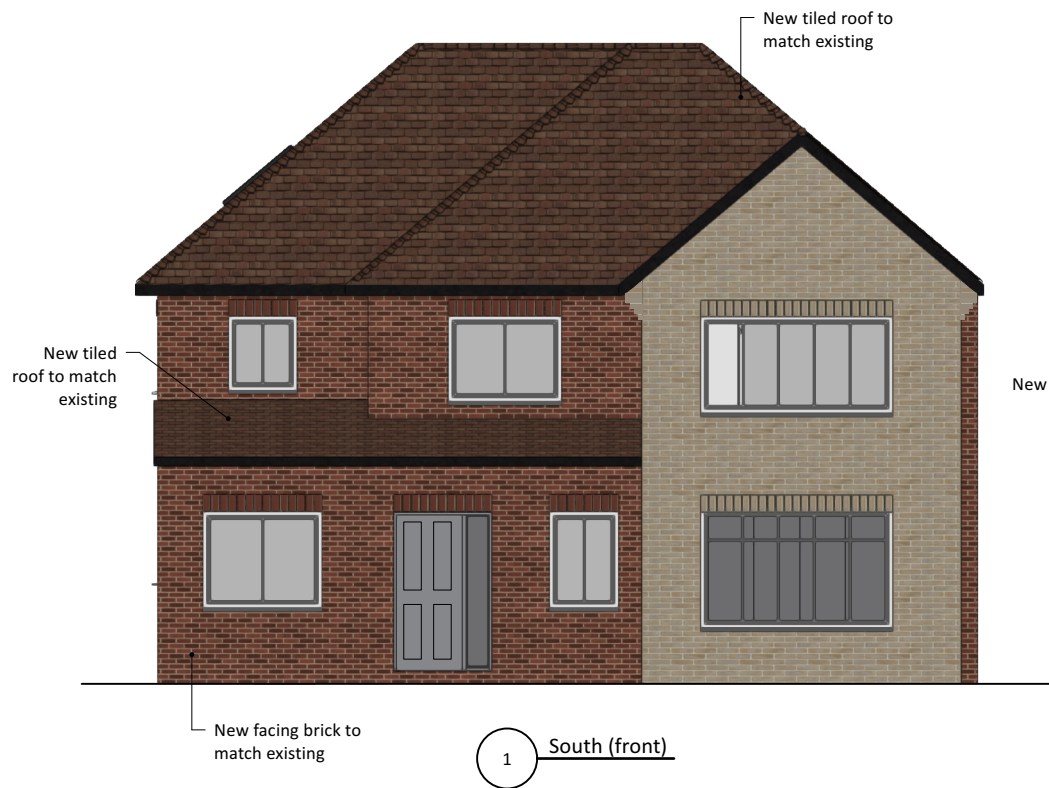
1 South (front)