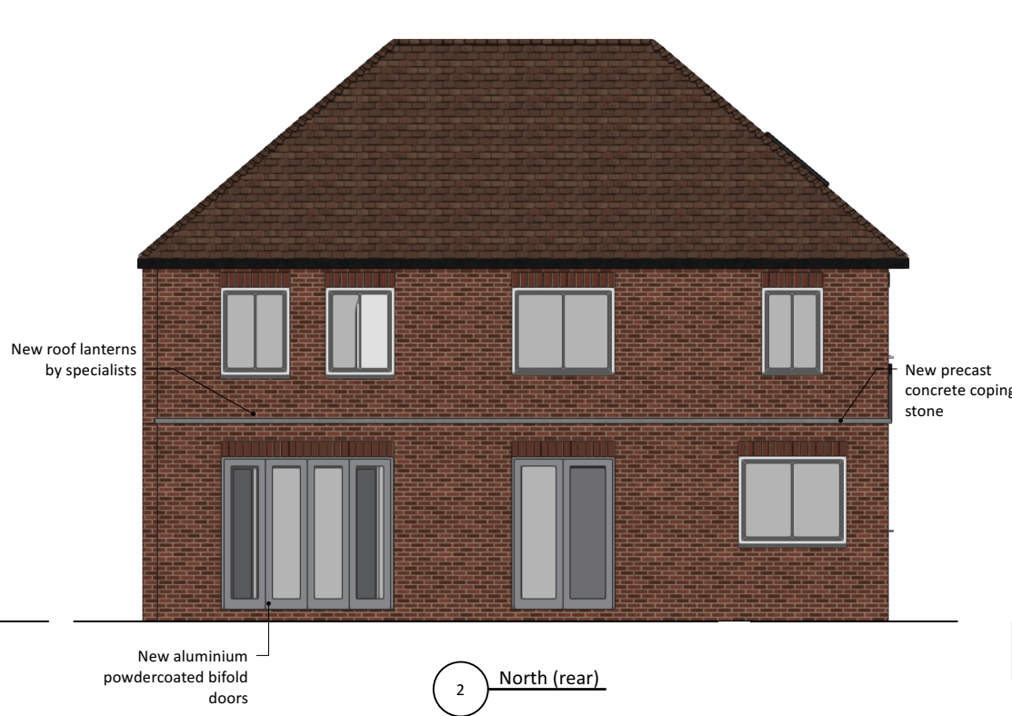
2 North (rear)