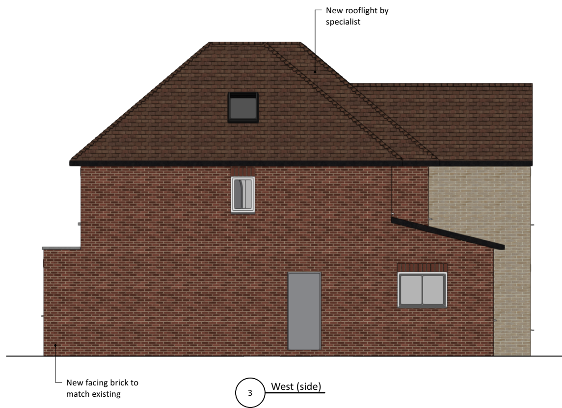
3 West (side)