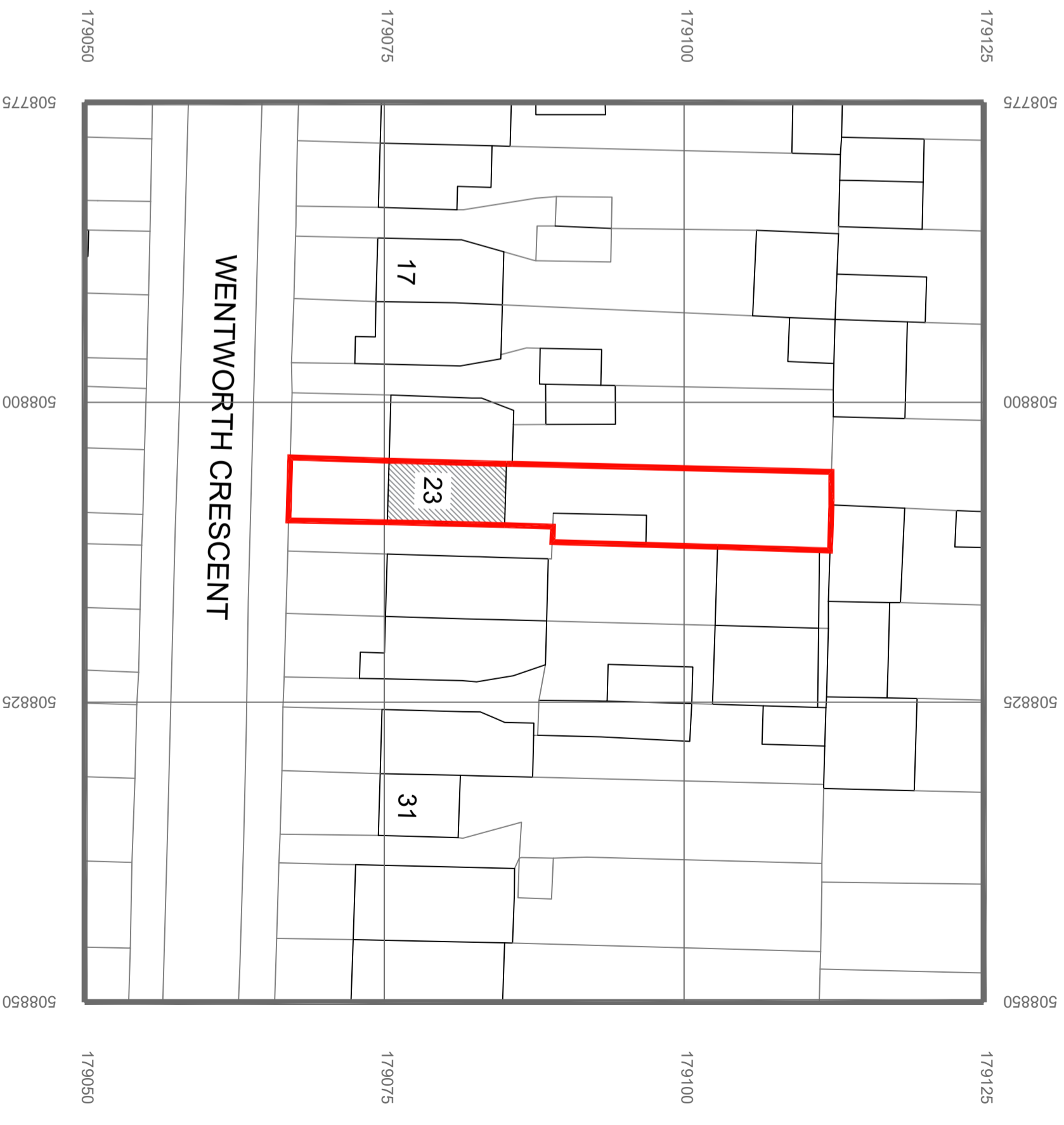
Site Plan Scale 1:500@A3

© Crown copyright 2020 Ordnance Survey 10005143