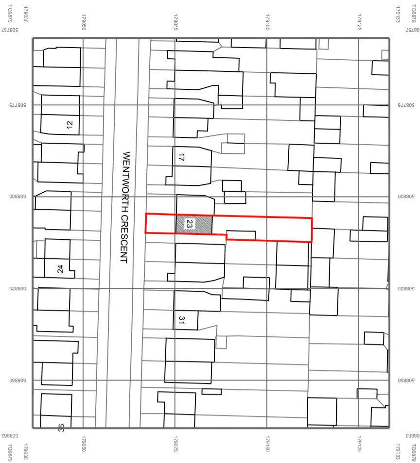
Location Plan Scale 1:1250@A3