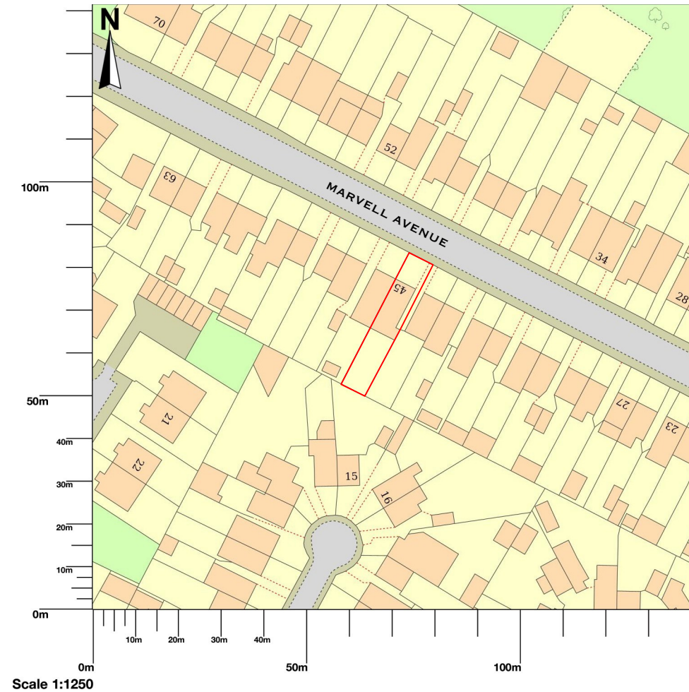
O1 A3 LOCATION PLAN SCALE: 1:1250

© Crown copyright and database rights 2025 OS 100054135. Map area bounded by: 510369,181731 510511,181873. Produced on 28 March 2025 from the OS National Geographic Database. Supplied by UKPlanningMaps.com. Unique plan reference: p2f/uk/1232682/1654716